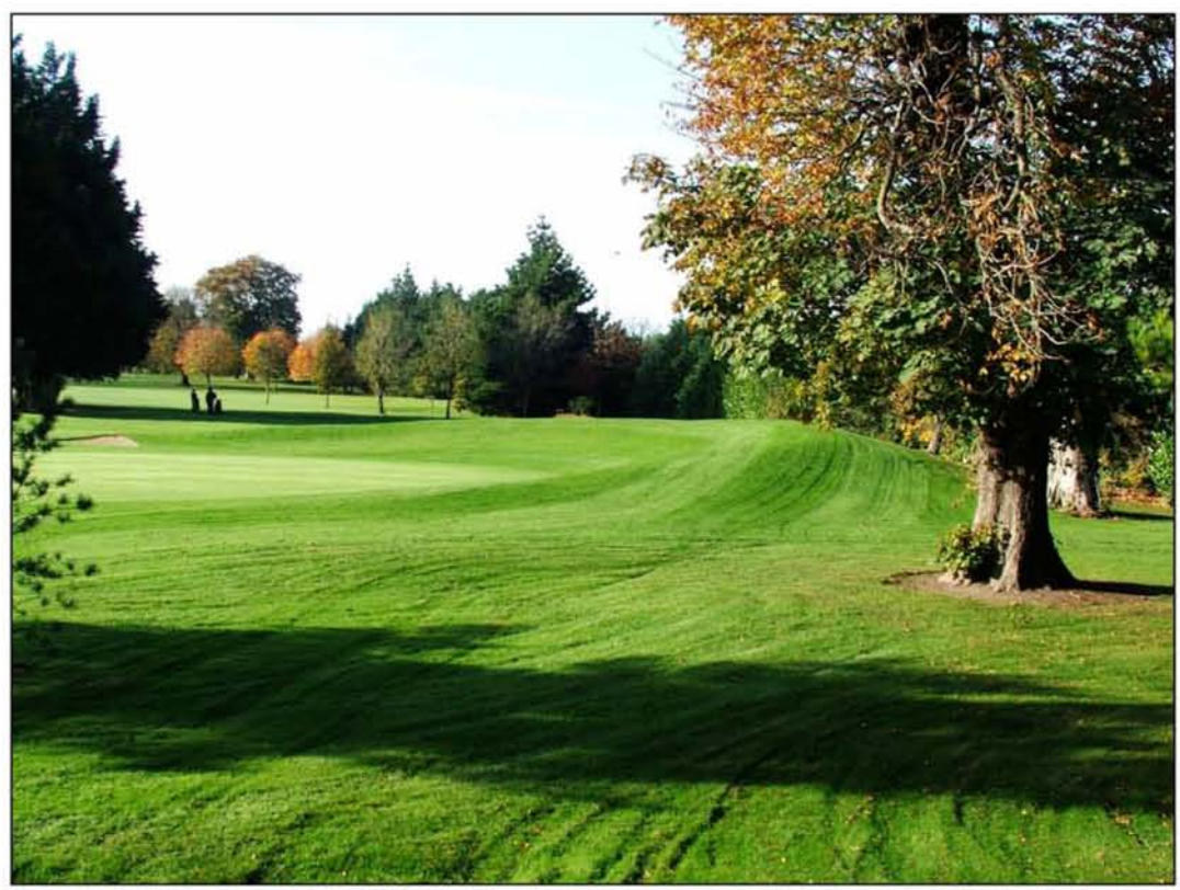
Plate 22 View along northern boundary of Newlands Golf Course, facing west