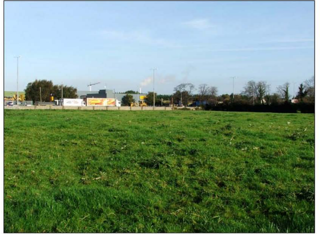
Plate 23 View of western pasture field south of N7 road, facing east