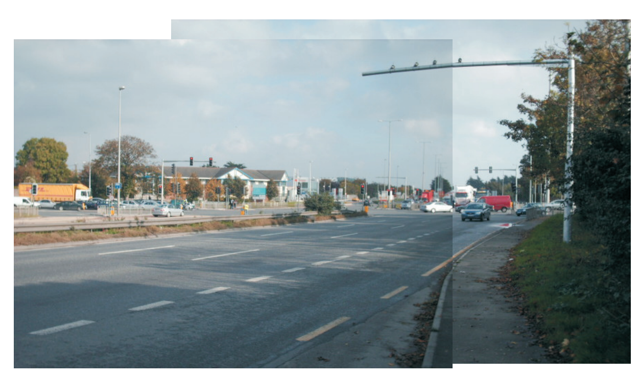
View looking east along the N7 roadway towards the junction Plate 3.1