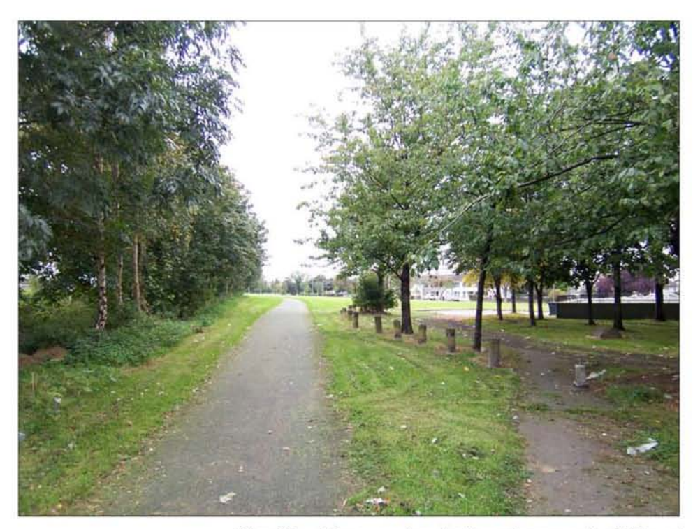
Plate 26 View west along landscaped area north of N7 road

Archaeological, Architectural and Cultural Heritage Plates