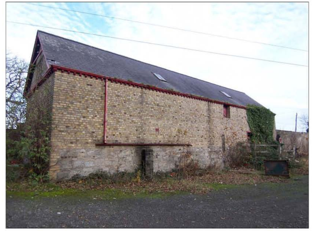
Plate 3 View of farm building (ID 3), facing north