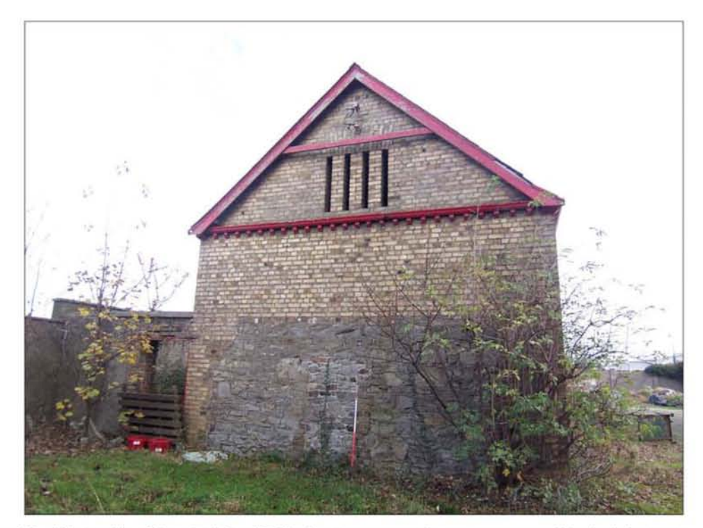
Plate 28 West gable of farm building (ID 3), showing masonry lower courses and blocked doorway