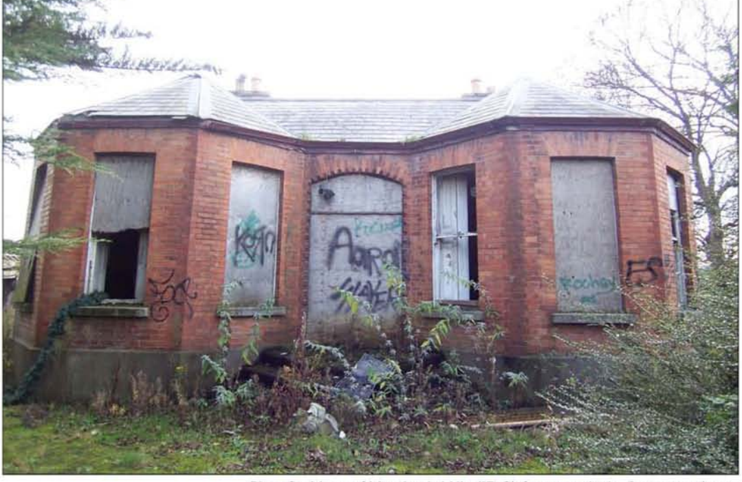
Plate 2 View of Newlands Villa (ID 2) from roadside, facing southeast