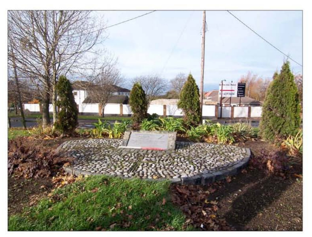
Plate 27 Veronica Guerin memorial at Boot Road junction