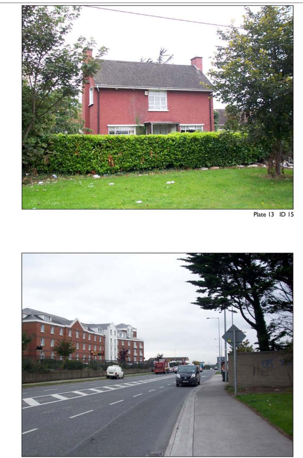
Plate 14 ID 17