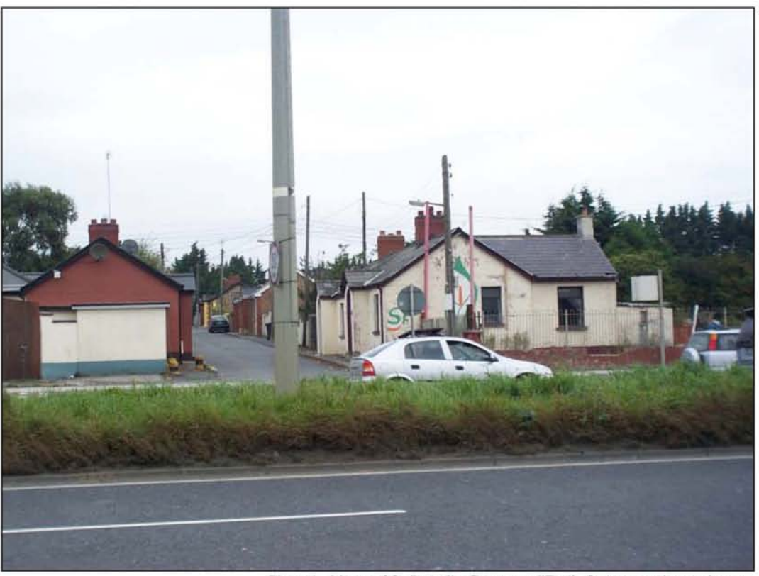
Plate 4 View of St Brigid's Cottages (ID 4), facing north-northwest