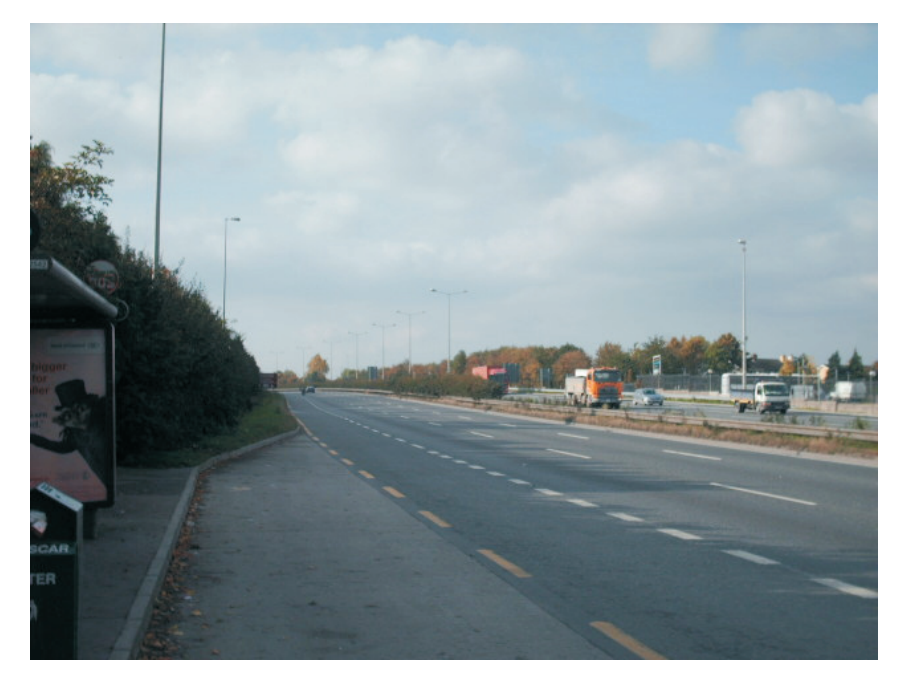
View showing the low visual amenity value along this section of the N7 road corridor Plate 3.6