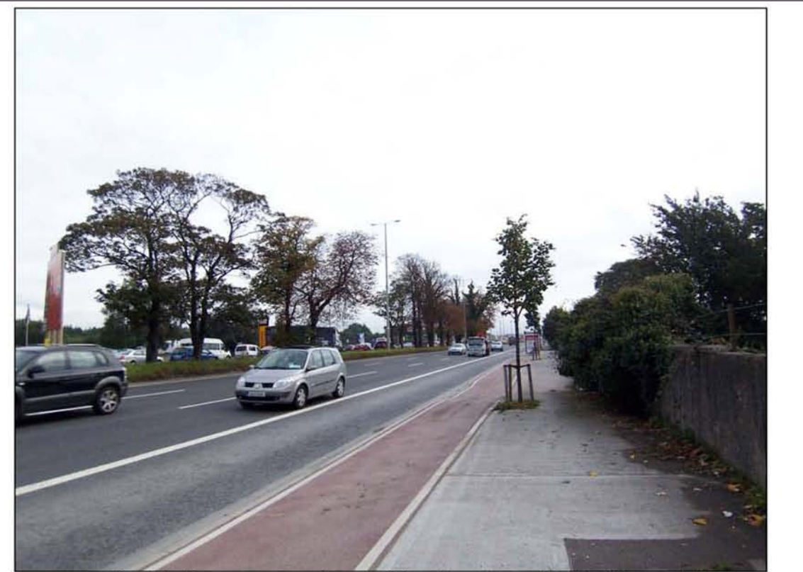
Plate 21 Mature trees in median, south boundary of original Dublin / Naas road, facing east