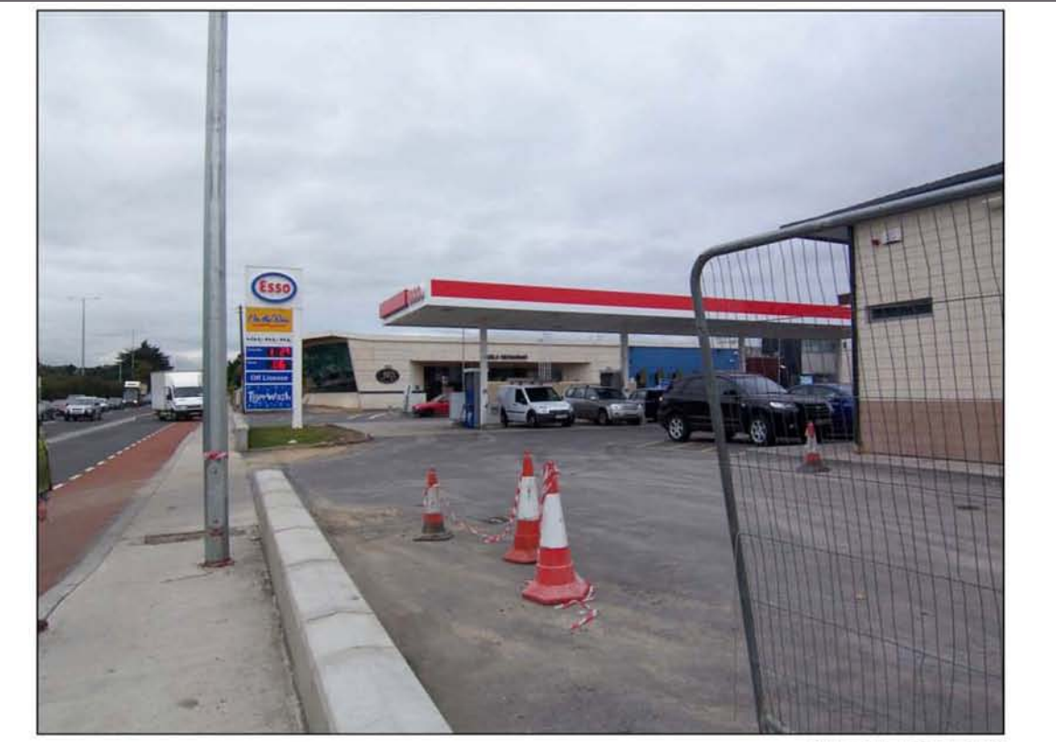
Plate II ID II & I2