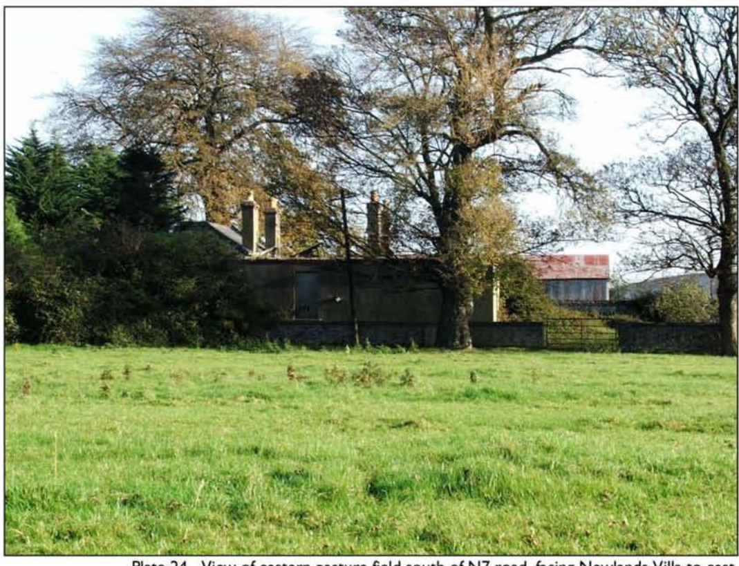
Plate 24 View of eastern pasture field south of N7 road, facing Newlands Villa to east