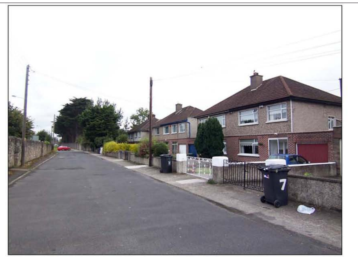
Plate 7 View of mid-20th century terrace (ID 7)