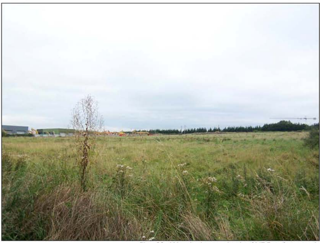
Plate 20 Wasteland on north side of N7 East, facing north