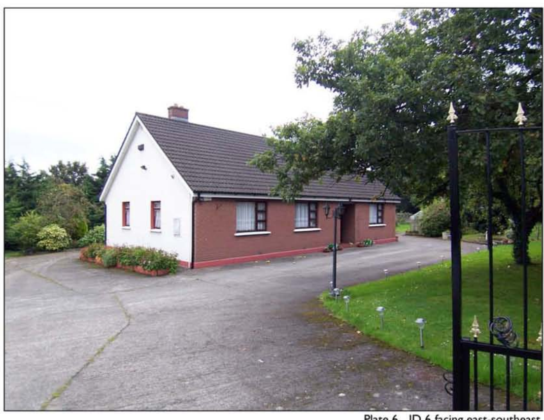
Plate 6 ID 6 facing east-southeast