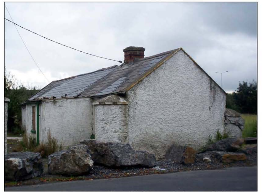
Plate 5 Mid-19th century derelict cottage (ID 5), facing south