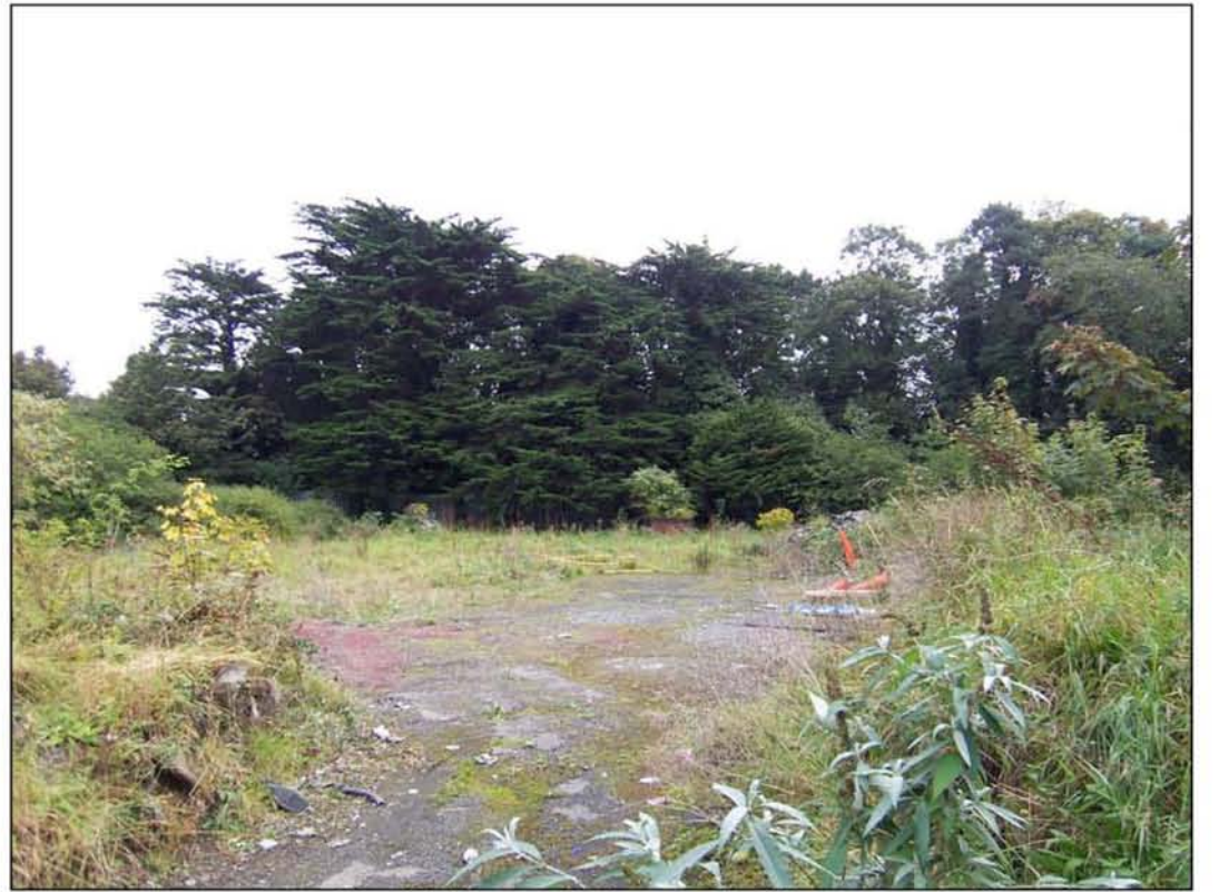
Plate 19 Unoccupied plot to north of Mooreenaruggan House, facing south