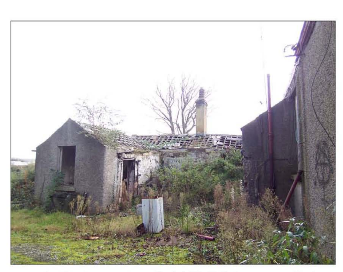
Plate 29 Later extensions to Newlands Villa (ID 2), showing extent of fire damage