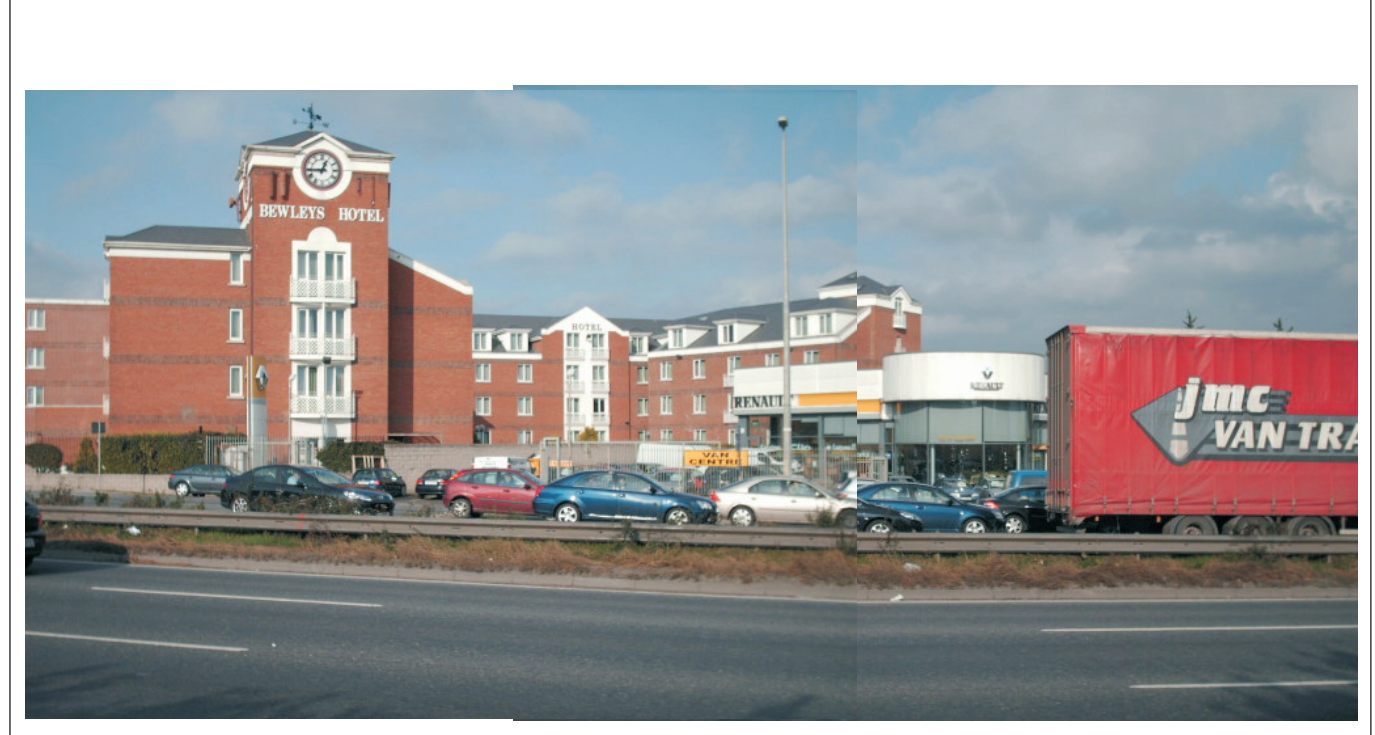
View showing the visual dominant feature of the Bewleys Hotel Plate 3.5