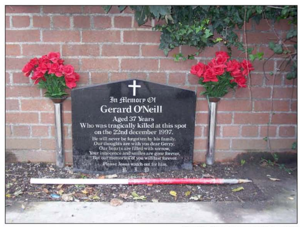
Plate 16 Roadside memorial (date 1997)