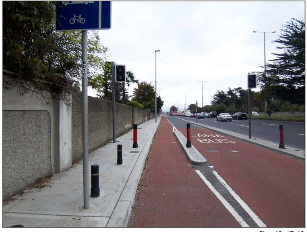
Plate 12 ID 13