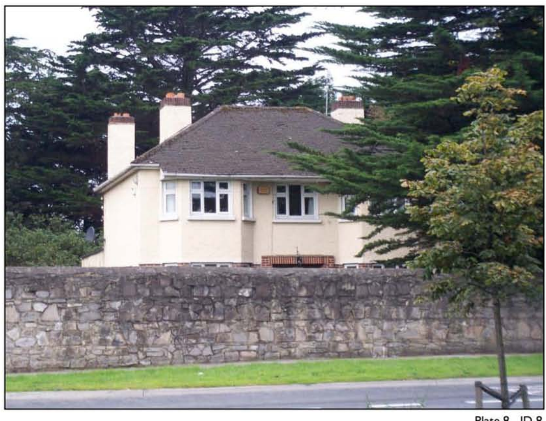
Plate 8 ID 8