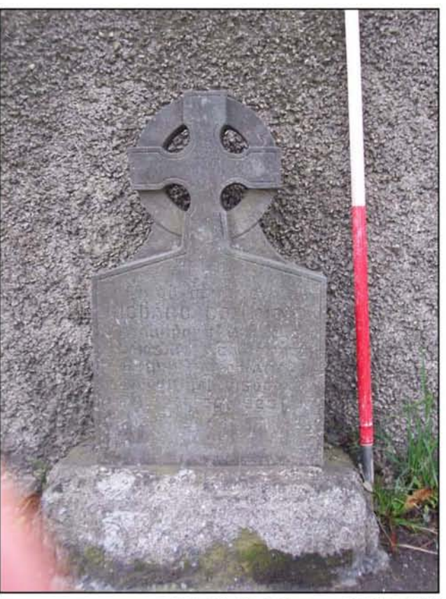
Plate 15 Roadside memorial (date 1923)