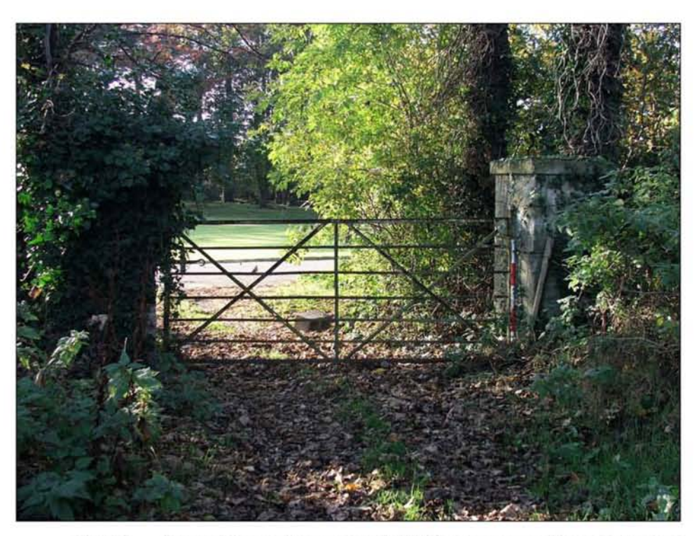
Plate 25 Gate and stone pillar associated with Mooreenaruggan House, facing west