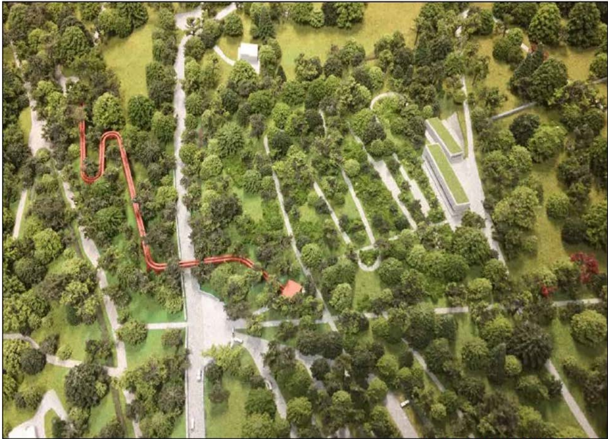
Aerial view of model of proposed Dublin Mountains Visitor Centre