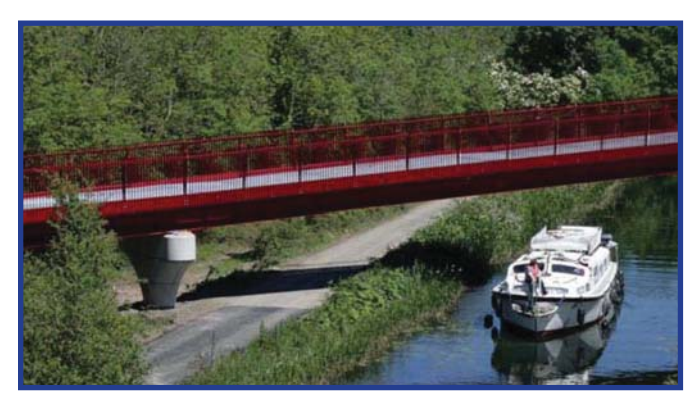
Grand Canal Green Route Extension

The Grand Canal Green Route Extension to Adamstown and Griffeen Avenue, Lucan was officially opened on Friday 1st July 2011 by the Minister for Children and Youth Affairs, Frances Fitzgerald, T.D. in the presence of Cllr Guss O'Connell, Lucan Area Chair, Deputising for Mayor of South Dublin County Council.