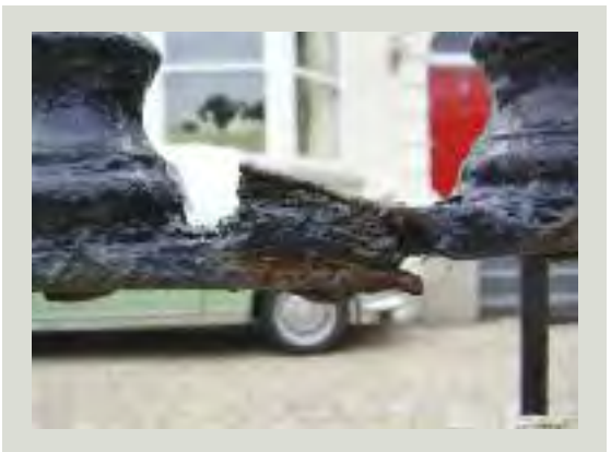
Corrosion developing at a scarf joint

This can either be caused by advanced corrosion as described above, or by corrosion of the fixings (usually wrought iron pins) holding individual sections of rail together. The joint – normally a 'scarf' joint where the ends of each section overlap each other and are held together by the pin – can be re-secured using a stainless steel pin which should be isolated from surrounding material using a nylon sleeve or washer. Care should be taken to match new fittings to the originals, which traditionally were straight bars hammered into rounded caps, top and bottom, to secure them in place.