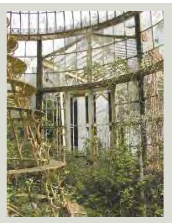
This finely-made circular conservatory was designed and erected at Castlebridge House, County Wexford by James Pierce of Mill Road Iron Works, Wexford. In addition to its iron structure, it contains a 10-tier iron display stand for plants at its centre

The conservation of adjacent materials such as tiled floors, supporting masonry or glazing should not be overlooked when dealing with larger projects. Traditional plain glass is an often-overlooked aspect of glasshouse conservation. Many types of traditional conservatory glass are no longer manufactured and the retention and conservation of existing glazing in such structures will merit consideration.