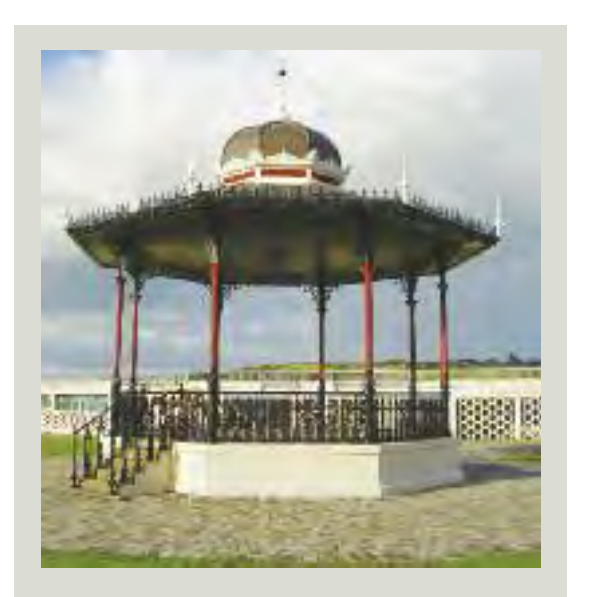
Bandstand, Youghal, which was made by the Scottish firm McDowall Steven & Co.