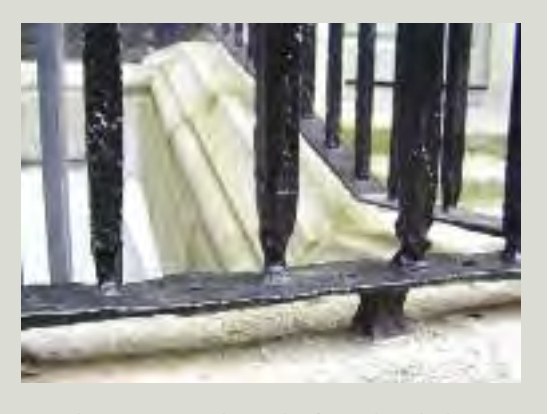
Bars do not necessarily need to be replaced when they have wasted at their base. Unless their condition is compromising the integrity of the ironwork, they can be left in place

However, where corrosion has eroded too much of the bar, leading to instability, the corroded section should be removed and replaced with a new piece of wrought iron. Only the corroded section should be replaced. If bars are removed to carry out repair work, they should not be cut out above and below the rail. The hammered end of the bar, which fixes it in place on the underside of the rail, will need to be broken off in order to remove the bar and piece-in the new section of iron. When the repaired bar is reinstated, it should again be slotted through the holes in the rails as it was originally, and the end of the bar bradded on the underside of the rail to hold it in place. The new material should be forge-welded in place if work is being done off-site. Where work must be done in situ, it will be necessary to use modern welding techniques, taking care not to damage the adjacent stonework.