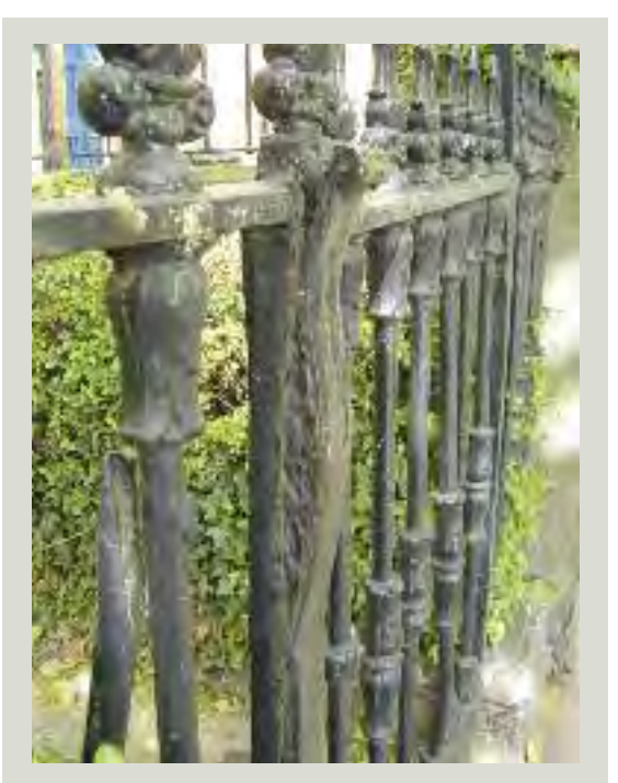
Corrosion between the gate frame and slam bar is common

A common problem with gates is that the slam bar (the flat section of wrought iron on the frame), or the section of iron behind it, begins to corrode. Slam bars will buckle or fracture as corrosion develops. The slam bar should be removed, cleaned, and reshaped and any corrosion from the underlying ironwork thoroughly removed. Both surfaces should be painted before the slam bar is replaced.