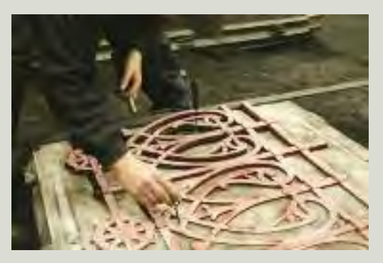
Green sand moulding is a highly skilled craft. This image shows a timber pattern being removed from one half of a green sand mould