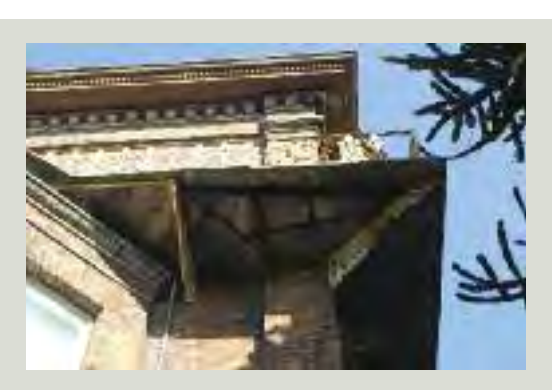
It is particularly important to ensure that all elements of a balcony are sound and secure to prevent injury to people stepping onto the balcony, or standing beneath it