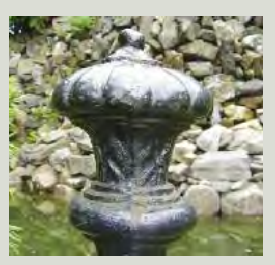
Castings should be checked before they are put in place to ensure that they are of acceptable quality. The casting illustrated above is deformed because the two halves of the mould were not aligned correctly during the casting process