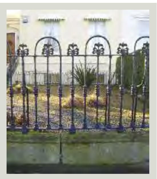
Early nineteenth-century railings incorporating fashionable Neo-Classical decoration such as cast iron collars, husks, and anthemion (honeysuckle) finials

In the late eighteenth and early nineteenth centuries, cast iron was increasingly incorporated into ornamental ironwork. For example, a gate frame made of wrought iron would be embellished by ornate cast iron infill panels, husks, finials, and collars. Railings with wrought iron bars topped by a diverse range of ornamental cast iron finials also became widespread. Wrought iron railings and gates embellished with cast iron details can be found in virtually every town and city across Ireland.