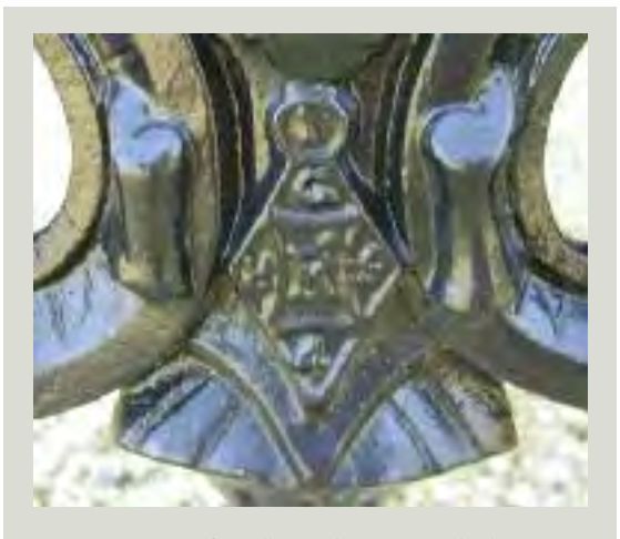
Registration marks will give the year in which a particular design was registered

For ironwork of any significance or scale, further historical research should be carried out to discover more about its history and origin, although this can equally be carried out for more common ironwork. Makers' names and other marks such as supplier stamps or registration stamps can often be found on both large and small-scale ironwork on flat surfaces such as bottom rails, gate slam bars, or column and post bases. Blacksmiths often stamped ironwork, particularly on the slam bars of gates. Similarly, cast iron manufacturers, would cast their name into ironwork.