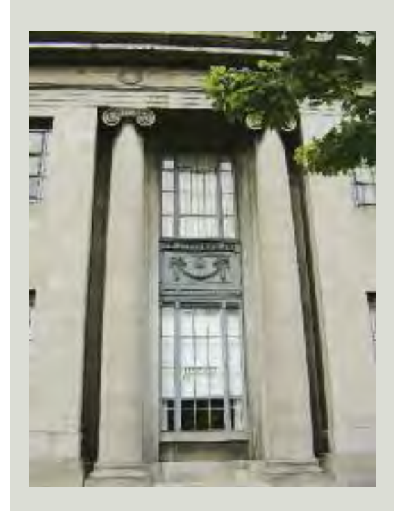
The National Concert Hall, Earlsfort Terrace, Dublin. Cast iron windows and spandrel panels became increasingly widespread from the start of the twentieth century. This example was supplied by the Scottish firm Walter Macfarlane & Co. Ltd in 1914