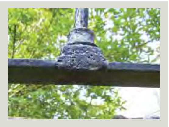
Paint cannot fill holes. Casting flaws such as those pictured above should be filled to prevent water becoming trapped and causing corrosion to develop

Paint cannot bridge gaps, so fillers and sealants are an integral part of any coating system. They waterproof joints and seams, and can re-profile water traps and casting defects so that they shed water properly. Traditionally, red lead paste (still available from chandlers) was used to caulk large joints. Putty and white lead paste were often used for smaller joints. White lead is not likely to be an acceptable material to use today because of its toxicity. Modern polysulphide mastics can be used as an effective alternative to traditional fillers.