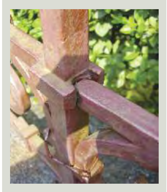
Cast iron railing panels were joined together by means of lugs and slotting systems such as the arrangement illustrated above

This design is typical of cast iron panels cast in repeating, identical sections. Patterns for railings such as these had to be designed so that there were no undercuts – it had to be possible to pull the pattern out of the sand mould without pulling away any of the sand (which would get trapped behind undercuts) in the process. Some panels have a taper from one side to the other which aided the removal of the pattern from the sand mould