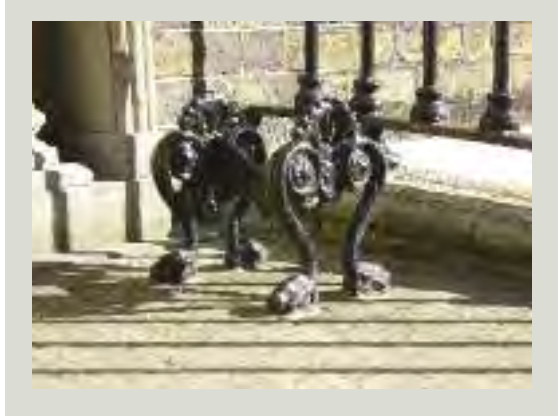
Eighteenth- and nineteenth-century boot scrapers are still a common feature of houses across Ireland