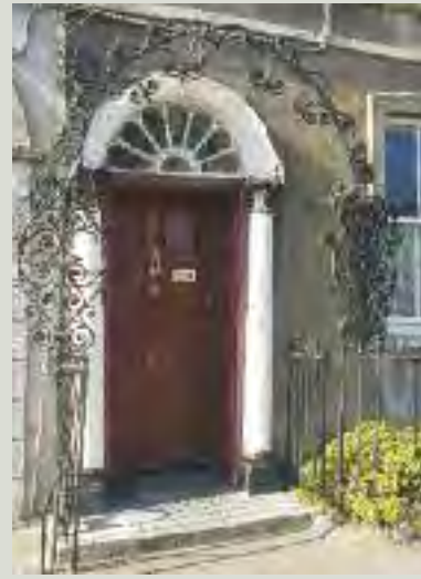
This is a rare example of superb late eighteenth-century wrought ironwork. This highly ornate arch required considerable skill to make

replacing or repairing. Mild steel replicas are all too often made by fabricators (a term that is much confused with the term 'blacksmith') who usually do not have a knowledge or understanding of traditional blacksmithing. The result is a poor quality of design that has none of the detailing that gives traditional ironwork its character and visual appeal. Ultimately such a product is more likely to detract from, rather than enhance, the character of the historic building it adjoins or is part of. It therefore makes sense to repair and retain historic ironwork wherever possible. It is more durable than modern alternative materials and has been made with a level of skill that is rarely matched today.