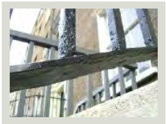
Where new rails are installed, traditional detailing should be matched where possible, such as piercing bars through the rail

If the corrosion is severe, it may be necessary to remove the corroded areas and piece-in new wrought iron. Mild steel should preferably not be used, as this can create further potential for galvanic corrosion by introducing a third type of metal to the railing. Problems will be further compounded if modern welding techniques are used. Ideally, wrought iron should be forge-welded in place but, where this is not possible, a stainless steel piece should be carefully welded into position, taking care to remove all weld splatter. The new metal should be well painted and regularly maintained to ensure that it remains isolated from the surrounding cast and wrought iron in the future.