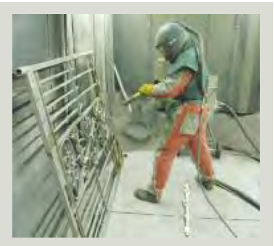
Blast cleaning ironwork in a blast chamber

A variety of blast mediums can be used, ranging from inert mineral grit to glass beads, plastic pellets, and crushed walnut shells. Sand used as a blast medium is now subject to an international ban due to the danger of silicosis. The use of chilled iron and copper slag is not recommended. An inert mineral grit is one of the most effective blast mediums for cast iron, and will provide a good surface for new paint. For more delicate or highend conservation work, glass beads and crushed walnut shells provide a more sensitive blast medium. Plastic pellets can be particularly effective for cleaning wrought iron as they are less hard than other mediums and may enable the original mill scale layer to be retained. If work is to be carried out on ironwork in situ, it may be necessary to consult with the local authority to ensure that this cleaning method is permitted. Blast cleaning may not be possible on-site due to issues concerning waste disposal and other health and safety implications. Where blast cleaning is to be carried out on ironwork in situ it is important to ensure that surrounding materials are carefully protected and that appropriate safety measures are taken to protect members of the public.