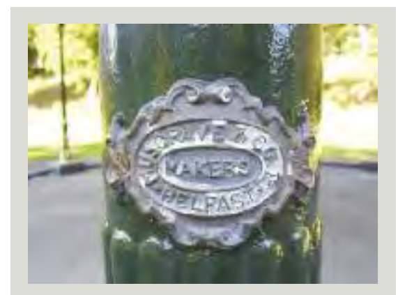
Musgrave & Co.'s name cast into the column of a bandstand in Phoenix Park, Dublin

Numerous foundries focused on millwrighting, engineering, or heavy castings but also produced smaller-scale decorative ironwork. There were a number of large operations in Dublin: Tonge & Taggart supplied many Dublin coalhole covers, while Hammond Lane produced the lamp standards that line the streets of Rathmines. Cork had several large foundries, such as Perrott and Hive Ironworks. Musgrave & Co. of Belfast was a significant operation known for its patented stable and agricultural fittings, which were exported around the world, and also for larger structures such as the bandstands in St Stephen's Green and Phoenix Park, Dublin. Makers are often identifiable, thanks to their name cast into ironwork, or stamped onto wrought ironwork.