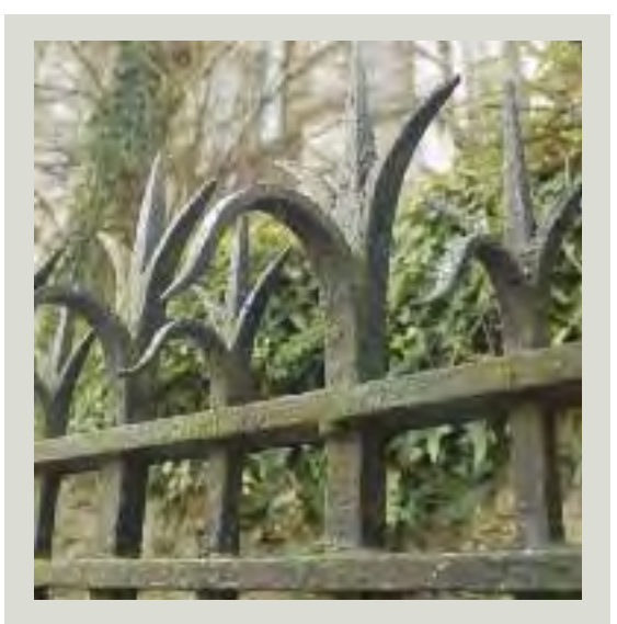
Note the pin just below the top rail of these wrought iron railings which would have been used to hold the rail in place during the assembly of the railings in situ

The last puddling furnace for producing wrought iron in England closed in 1974, and since then no wrought iron has been produced in Ireland, the UK, or the rest of Europe. Wrought iron is currently only available as recycled material and can be obtained from a single supplier in the UK. As a result, the cost of wrought iron can be up to ten times that of mild steel (its most common substitute), and sourcing wrought iron can take much longer. Because new wrought iron is no longer produced, it is a virtually irreplaceable material. Every effort should therefore be made to retain as much of it as possible. Despite the difficulties in obtaining the material, there are very real benefits to using wrought iron for repairs. First, using the same material eliminates the risk of galvanic corrosion which is caused by two dissimilar materials being placed beside each other. This is a common problem with mild steel repairs. In addition, wrought iron is generally considered to have excellent corrosion resistance - a repair using wrought iron will be a long lasting one.