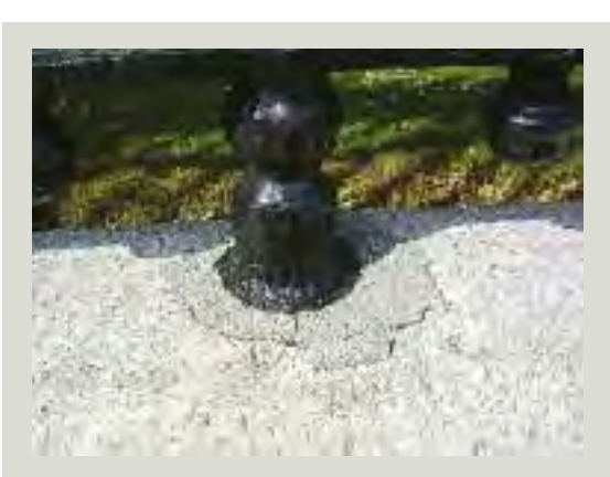
Crushed stone mixed with mortar has been used to fix this ironwork into the masonry socket