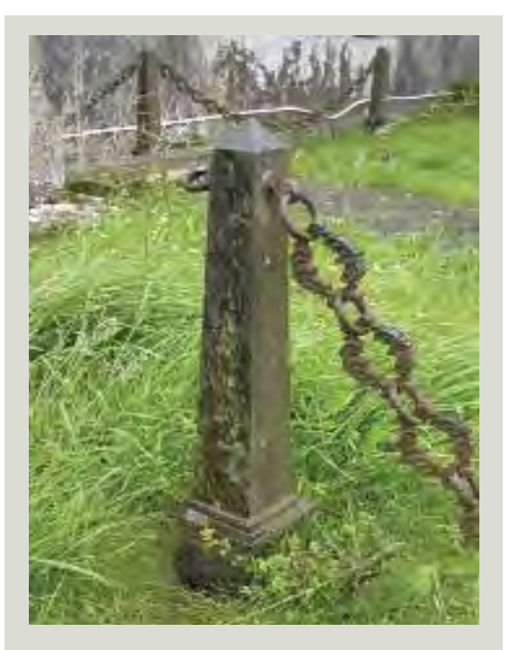
There is a rich heritage of iron grave markers and grave surrounds to be found throughout the country. This example from Co. Offaly is marked with the maker's name – P & E Egan Tullamore

Corrugated iron was first patented in 1828 by Henry Robinson Palmer and was a popular material throughout the nineteenth century and into the opening decades of the twentieth. It was made by passing thin sheets of iron through rollers, which gave them extra strength and rigidity, and was available in a variety of lengths, sheet thicknesses, and profiles. Due to its lightness, cheapness, flexibility and ease of assembly, corrugated iron became a popular material. It was often used for roofing, sometimes covering earlier thatched roofs which were retained beneath. Corrugated iron was also used to make pre-fabricated structures, particularly vernacular, agricultural and religious buildings. These were usually formed using a timber frame clad with corrugated iron. Manufacturers developed a range of patented building designs, as well as fixings and features such as windows specifically designed for use with corrugated iron. It is important to retain as many of these original features as possible as replacements are no longer available.