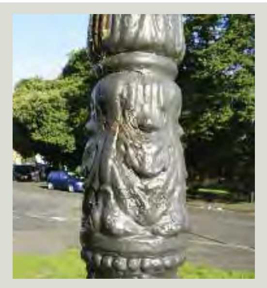
Over-thick application of paint will obscure detail and result in less effective protection

Coats must be applied in thin layers, allowing each to dry thoroughly before the next coat is applied. This prevents solvents evaporating from the layer underneath and damaging subsequent coats painted on top. If paint is applied too thickly it obscures detail, is unlikely to cure properly, and will be less effective as a result. Paint that is improperly applied to uneven surfaces may bridge depressions and hollows instead