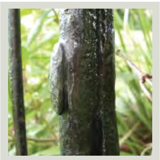
Original wrought iron backstay fixed in place by means of a bradded (riveted) pin

Backstays occasionally become loose or detached from railings. Where the backstays are of wrought iron, this problem is usually caused by the corrosion and failure of the pin that holds them in place. If the backstays are made of cast iron, settlement of the wall supporting the railings may cause the railings to shift, exerting pressure on the cast iron backstays, eventually causing them to fracture. Wrought iron backstays should not be reattached by welding. Other stays found on the rest of the run of railings will indicate the original detail, and this should be replicated for any repairs.