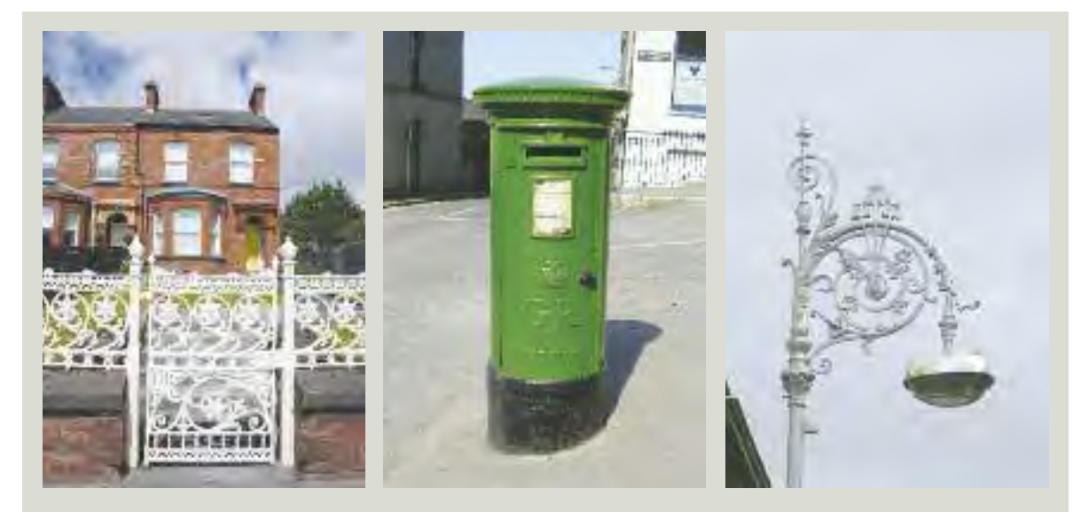
Cast iron railings and gate, Limerick

Nothing will remain in perfect condition forever if it is not cared for and maintained regularly. A simple regime of repainting once every five years, and touching up smaller areas of paint loss in the intervening period, will do much to prolong the life of historic ironwork. There are many cleaning and repair techniques that can be used to repair corroded or damaged cast and wrought ironwork. Even when ironwork may appear at first glance to be irredeemably corroded or damaged, it is often perfectly possible to repair. Corrosion often looks far worse than it actually is.