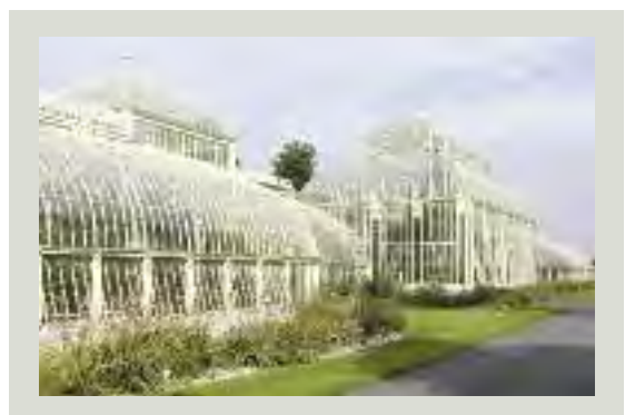
Turner glasshouse, Botanic Gardens, Dublin