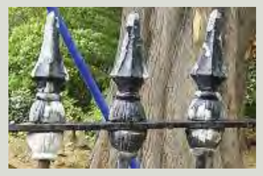
Aluminium is not an appropriate substitute for grey cast iron