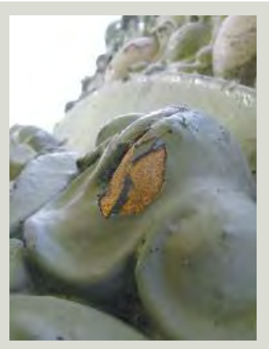
Original decorative schemes, such as gilding, can be hidden under layers of modern paint

For smaller projects, this need not be an expensive undertaking. A feathered cut into ironwork can also be an effective means of revealing consecutive layers of colour. But it needs to be borne in mind that different coats – primer, build coat, and top coat – were often different colours, making it difficult to recognise which layer was the finished appearance of the paintwork. Primers can sometimes be easily distinguished as they were often a red colour, particularly where traditional red lead paint was used. Some paint colours will have changed from their original appearance under the influence of sunlight and other factors.