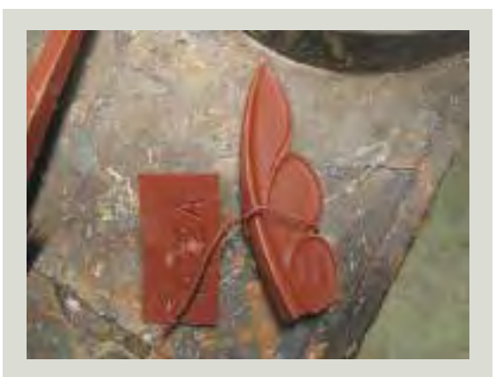
Attaching metal tags to ironwork as it is dismantled (numbered to correspond with a measured survey drawing) is essential for tracking repairs and for correct reinstatement

For domestic-scaled ironwork such as railings, the contractor should be able to produce a simple measured drawing and photographic survey. The recording and assessment of larger or more complex examples of ironwork will require the services of a suitably qualified and experienced architect, surveyor or engineer as appropriate, particularly if the ironwork is performing a structural function.