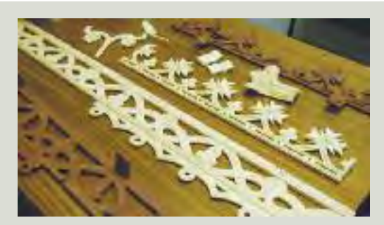
It is advisable to inspect patterns before they are used for making castings to ensure that the detailing is accurate and that the surface finish is smooth

removed and that the quality of the casting is good (for example, that the two halves of the casting align correctly) before being put in place.