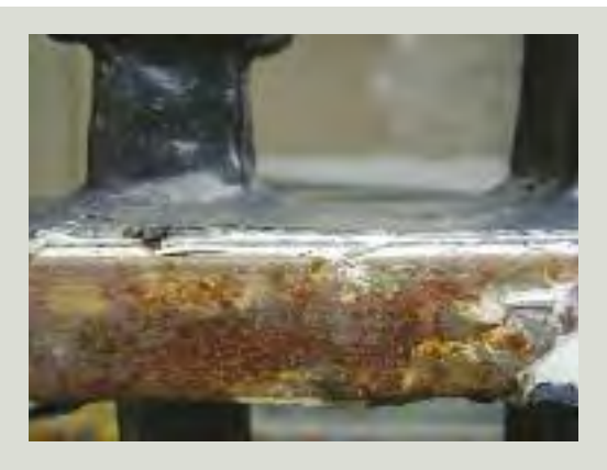
Analysis of paint scrapings can reveal much about earlier decorative schemes. Even viewing a section through the paint layers with the naked eye can often reveal useful information about underlying coats of paint