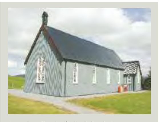
Lurganboy Church of Ireland church, County Leitrim. A fine example of a corrugated-iron clad 'tin church' built in 1862