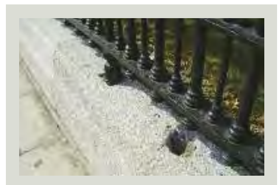
Accurately recording the position of each element of ironwork is essential and enables ironwork to be reinstated correctly after repairs. The railings illustrated above appear to have been reinstated in the wrong positions, resulting in a misalignment of the railing feet and original corresponding sockets in the coping stones