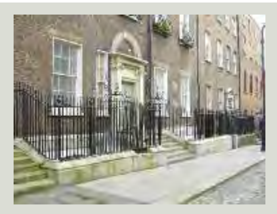
Early eighteenth-century wrought iron railings, Henrietta Street, Dublin. The large-scale development of squares and terraces from the 1700s onwards fuelled a rising demand for iron railings

From the eighteenth century onwards, as iron became more plentiful and affordable, it rapidly grew in popularity and came to be widely used in architectural decoration and embellishment. Its strength, versatility and durability made it the new building material of choice. These qualities would eventually change the face of architecture and engineering by enabling structures to be designed in previously impossible ways. As the concept of urban design became increasingly popular, newly developed streets and squares came to be bounded, enclosed, and demarcated by iron railings. In the eighteenth century, such railings were generally made entirely of wrought iron and were quite plain, complementing the Georgian architecture they adjoined. Very early wrought iron railings, dating to the first half of the eighteenth century, can be seen lining many of the houses along Henrietta Street, Dublin, and slightly later ones (1760s) on Parnell Square in Dublin and North Mall in Cork. These wrought iron railings were often complemented by decorative details such as cast urns, wrought iron lamp arches, or pillars decorated with fine scrollwork.