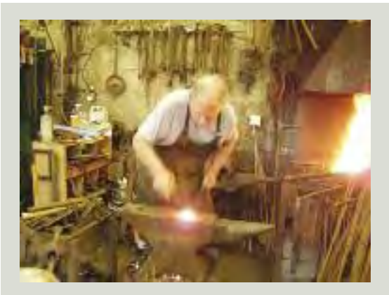
A blacksmith at work

forge wrought iron when it has been heated to varying temperatures in the forge, using either hand tools or a mechanical hammer. Shaping wrought iron or mild steel in this way takes great skill. Ideally, any weld repairs to wrought iron should be done in this way. The join will be unobtrusive and in keeping with the rest of the ironwork and will not be a weak point for the development of corrosion. Only wrought iron, which is malleable, can be shaped by forging. Cast iron is a brittle material and would shatter under the hammer.