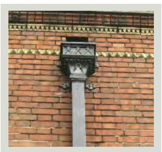
Rainwater goods such as gutters, hoppers, and downpipes should be inspected at least twice a year to ensure that they are clear of blockages. As with any other type of external ironwork, they should be painted at least once every five years

Rainwater goods (gutters, downpipes, hoppers, etc) perform an important function by carrying rainwater away from a building. If gutters, hoppers, and drains are not inspected and cleaned annually they can become blocked, causing water to back-up. Blockages are likely to cause water to seep into the building, either through the roof or through moisture-soaked walls. This can lead not only to cosmetic damage, but to the decay of the building fabric.