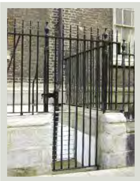
This replacement gate has been inserted sensitively and has been designed to tie in with the proportions and design of the original railings