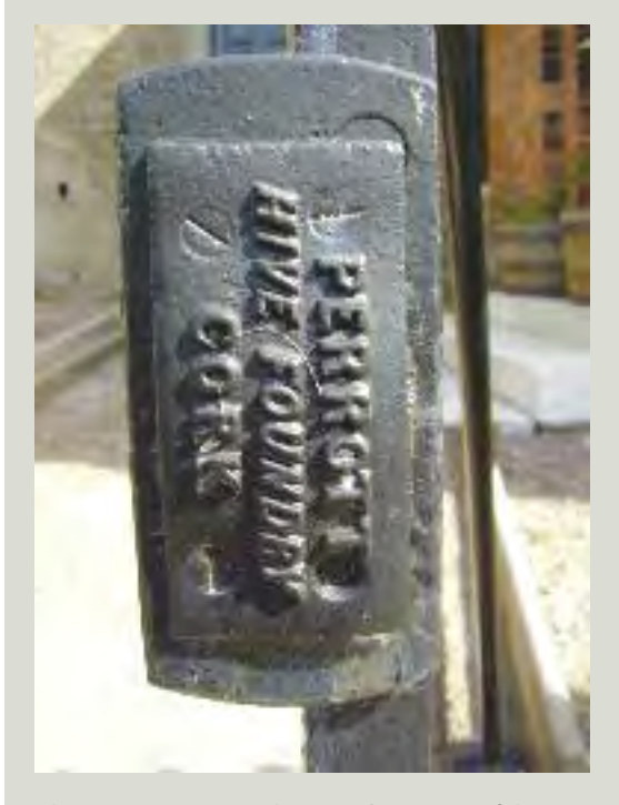
The Perrott Hive Foundry in Cork was one of the largest in the city in the late nineteenth century