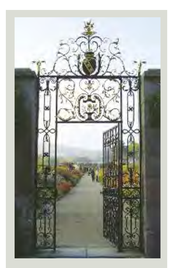
Delicate leaf-work is typical of wrought ironwork

Wrought iron was traditionally shaped by rolling and hammering it when hot. Both of these processes determine the types of shapes and designs that can be produced. Designs in wrought iron tend to be light and are usually composed of several individual pieces fitted together. Slight variations can often be discerned either in the overall pattern, or between similar individual elements within the pattern, as it is difficult to make any two handmade elements identical. One of the simplest ways of telling whether the bars of a gate or set of railings are wrought or cast iron is to look at the underside of the rails. Wrought iron bars pierce through rails and the bases of these bars are 'bradded' or 'riveted' (their ends are hammered into dome shapes) on the underside to hold them in place. Other sections of a wrought iron structure are typically held together using rivets, collars, mortice-and-tenon joints and other traditional methods based on joinery techniques. Wrought iron cannot be shaped by casting.