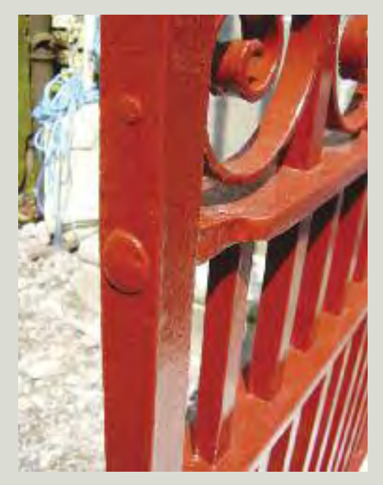
Wrought iron was traditionally assembled by means such as forge welding, collars, scarf joints, and mortice-and-tenon joints