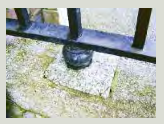
A stone indent has been inserted to repair a fracture or widened socket