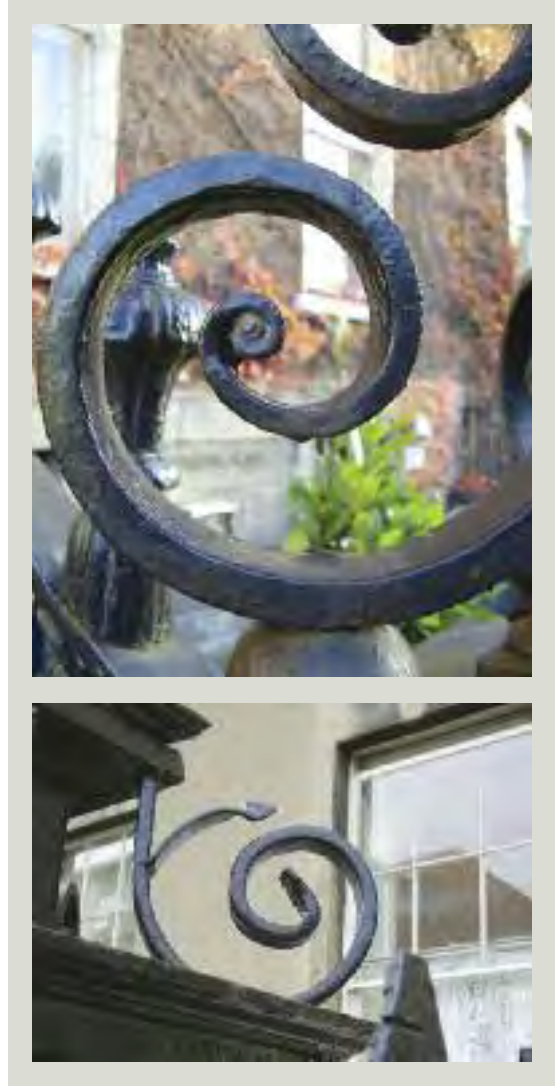
It is important to choose an experienced craftsperson to avoid inappropriate repairs. The replacement scroll in the lower image has been crudely formed and bears little resemblance to the finely-crafted original feature on a neighbouring property in the top image

However, wrought iron can be expensive and difficult to obtain, and may at times be beyond the budget of homeowners. Where a substitute material is to be