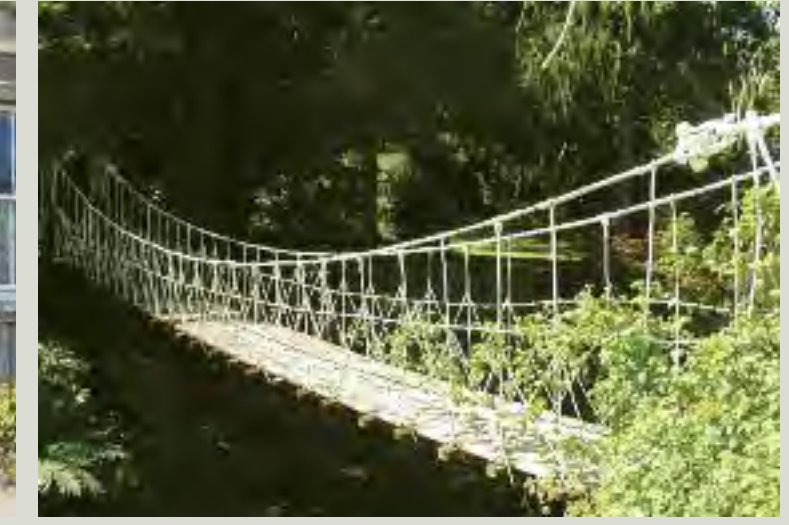
An early and unusual multiple-wire cable suspension bridge (1826) in the grounds of Birr Castle, County Offaly