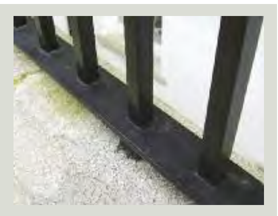
Replacement bars should pierce through the rail rather than be welded to it (as shown above)