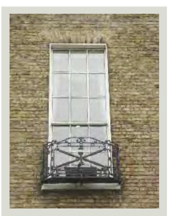
Due to their position and the potential for injuring people below, balconies and balconettes should be periodically inspected to ensure that they are secure

The maintenance and repair of iron balconies is particularly important due to their location and the likelihood of people standing on them. There is also the potential danger of sections falling from them and injuring people below. Balconies should be regularly inspected to ensure that they are safe and in sound condition, which may require the services of a structural engineer. Floors of iron or stone, supporting brackets, and the masonry or brick sockets into which they are inserted should be inspected regularly to check for signs of decay or damage. The repair techniques for balconies are broadly the same as for railings as outlined above.