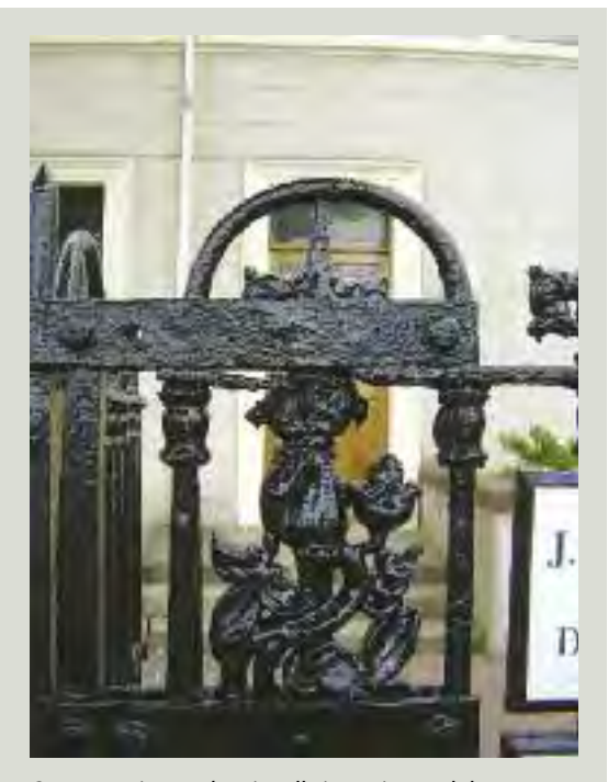
Strap repairs can be visually intrusive and detract from the appearance of ironwork

Strap repairs can be unsightly and their use is generally not recommended. However, they can be an effective short term, emergency measure to secure damaged ironwork until it can be correctly repaired. Straps should never be attached by drilling through the ironwork itself. Instead, two straps should 'sandwich' the iron and be bolted to each other.