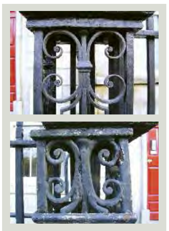
Posts from two different properties on Parnell Square, Dublin. While appearing to be severely corroded, much of the original ironwork in the lower example may remain intact beneath layers of paint and corrosion

Often, the nose (or centre point) of these scrolls has corroded severely, although the rest of the scroll may be sound. All too often, the entire scroll has been removed and replaced with a clumsy, ill-formed scroll, which has been poorly welded in place. This damages the appearance of the ironwork and the longevity of the repair. In many cases, the entire scroll does not need to be discarded at all. Only the corroded section should be removed and replaced. The rest of the scroll should be retained and new material pieced-in to match. Very often it is possible to find properties in the vicinity that retain the same, or similar, feature which can provide enough information for a blacksmith to replicate the detail.