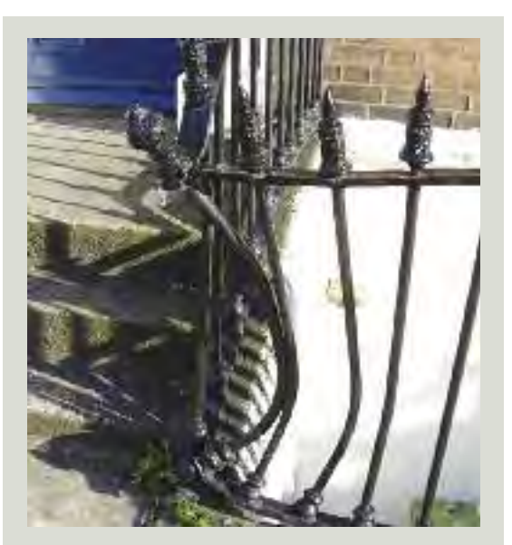
Impact damage caused for example by vandalism or cars, can cause deformation (in the case of wrought iron) and fracturing or shattering (in the case of cast iron)

The most common types of mechanical deterioration are caused by unstable or settling foundations and impact damage. Unstable foundations, corrosion of the base in which iron elements are anchored, or the settling of ground beneath ironwork can all cause instability, fracturing and deterioration of the ironwork.