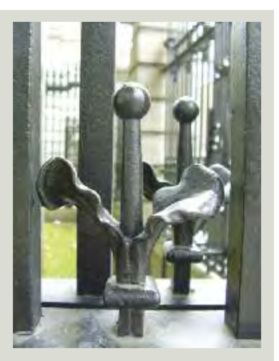
A new section of gate, based on the design of the adjacent gate at the entrance to Leinster House, Dublin. To prevent corrosion, water traps should be filled so that they shed water, or pinholes drilled at the base to allow water to escape (although drilling into original fabric should be avoided where possible)