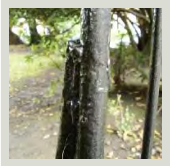
This backstay has been repaired by welding it back into position, which is not in keeping with the traditional techniques used to assemble this railing

Where cast iron backstays have fractured, the cause of their failure should be established and remedied. It may be necessary to re-stabilise the supporting wall and foundations of the railings. It may be necessary to recast the broken backstays, although brazing the broken sections together may be possible.