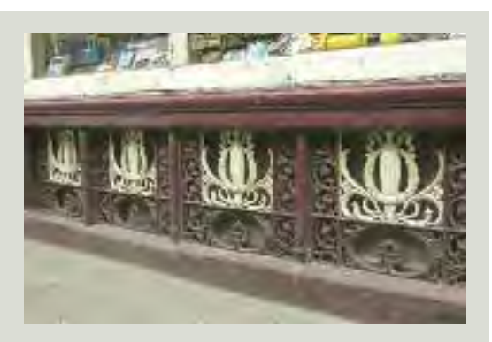
Routine maintenance to ironwork, such as this attractive cast iron stall riser to a shopfront should include gentle washing using a minimum amount of water to remove accumulated dirt

Routine maintenance should include cleaning ironwork with water and a cloth, or a bristle brush if the soiling is light, so that dirt does not accumulate on the surface and trap moisture. Excessive amounts of water should not be used. High-pressure power hoses should not be used on historic ironwork as they can drive water into small cracks and crevices from where it will be difficult to dry out. Ironwork should be thoroughly dried off after cleaning. Localised areas of corrosion can be removed using a chisel, wire brush (preferably bronze wire) and sandpaper before painting over the cleaned metal. If routine maintenance is carried out, this should prevent more serious problems from developing, which would require far more time consuming and costly repairs at a later date.