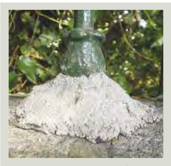
Concrete is not an appropriate material for the repair of ironwork, particularly in combination with stone

Concrete is often used to stabilise corroding bases of railing shafts or to fill damaged newel posts. It can be very damaging to ironwork and is not recommended for repairs to historic ironwork. Not only will such repairs damage the ironwork itself, but they are also likely to damage surrounding masonry. The concrete itself can corrode iron due to its alkalinity and, because it shrinks as it sets, it is likely to leave gaps between it and the metal, which in turn create moisture traps. The concrete may crack over time, drawing in and holding moisture against the iron and causing corrosion that is hidden from view. Such repairs are also visually damaging to the character of ironwork and can detract from the appearance of any adjacent stonework.