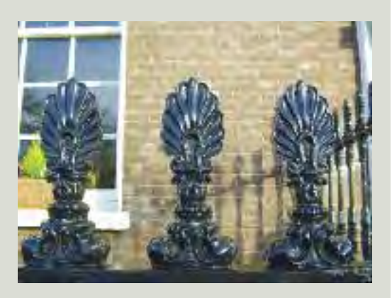
Mid nineteenth-century railings with wrought iron bars and rails, and decorative cast iron finials and husks

By the 1890s and early 1900s, entire railing panels cast in iron were becoming increasingly widespread. Cork, Dublin, Dundalk and Limerick have some superb examples. While much of this cast ironwork was made by local foundries, a significant proportion was also imported from England and Scotland. The production of cast ironwork had developed into a booming industry there and manufacturers, many of whom had offices in Ireland as well, produced extensive catalogues displaying an enormous variety of designs for railings, gates, rainwater goods, doorcases, balconies, lamp standards and other architectural components.