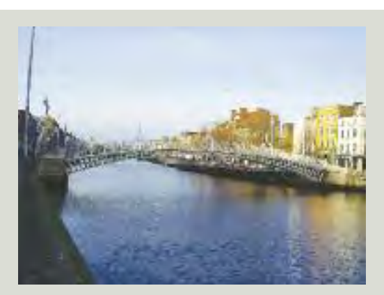
Dating to 1816, the Ha'penny Bridge is the oldest cast iron bridge in Ireland. It is also one of the earliest cast iron bridges ever made. Its parts were fabricated by the famous English firm Coalbrookdale, also responsible for making the first cast iron bridge in the world, which still stands at Ironbridge, Shropshire, England

The Ha'penny Bridge (originally Wellington Bridge but officially named the Liffey Bridge from 1836) in Dublin, underwent repair and conservation work in 2001. As it is believed to be the earliest cast iron bridge built in Ireland, it was particularly important to retain as much of the historic fabric as possible. A condition assessment showed that while the original superstructure was sound, the cast iron railings enclosing the walkway had failed at a number of points, posing a safety risk to the public. Various tests were conducted on the original fabric to establish its exact strength, which showed that the original cast iron was stronger than had been assumed. This scientific testing prior to devising a repair methodology enabled a compromise to be reached whereby 85% of the original railings were retained rather than replaced.