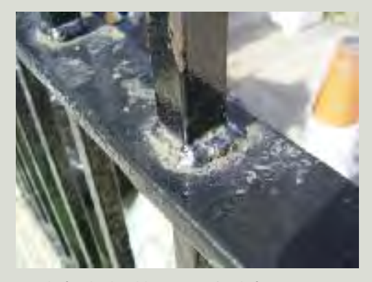
Poorly-finished weld joints can be disfiguring to traditional and new iron and steelwork alike