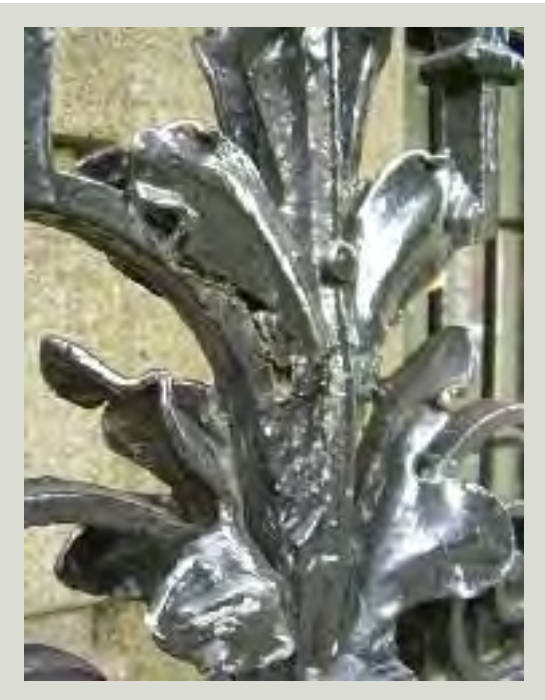
Water traps, such as the void areas behind these leaf details, will cause corrosion to develop at a faster rate