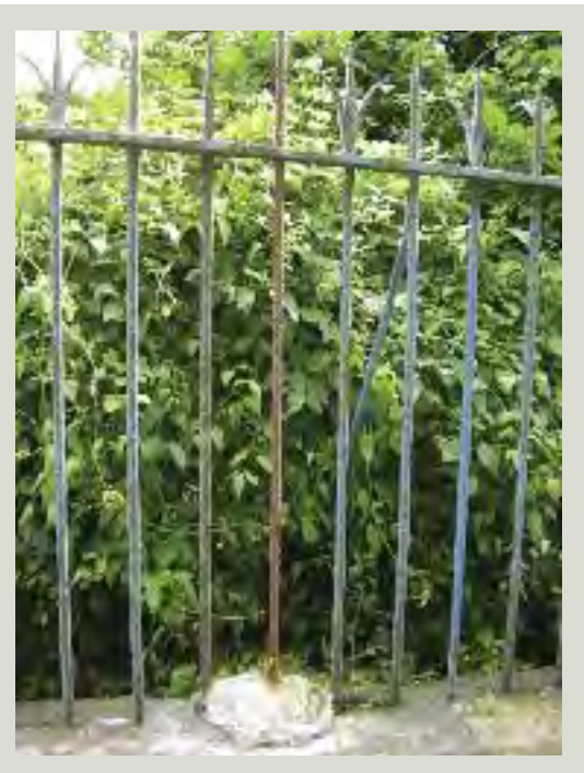
Repairs should be sympathetic to the design and traditional detailing of ironwork unlike this repair which is damaging to the appearance of the railings, will damage the stone coping and is likely to fail

Repair methods should be selected with care as inappropriate techniques can be damaging to ironwork in the long run. Poor quality repairs, resulting from either a lack of training and skills or bad practice, can detrimentally affect not only the appearance of ironwork, but also its longevity and resistance to corrosion.