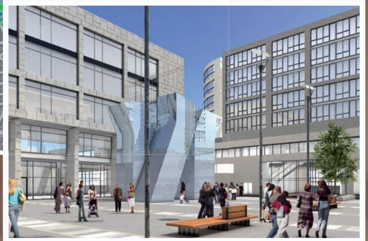
Tallaght Cross - Library Square