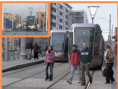
Before and After: LUAS Terminus