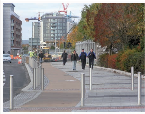
ZIP Pedestrian Walk

FROM GREEN FIELDS TO STREETS, SQUARES AND WALKS