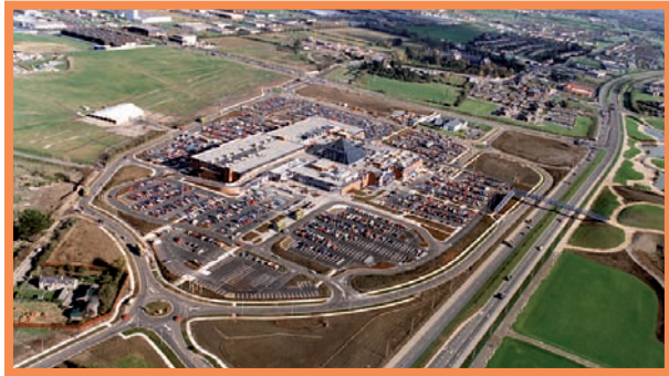
Tallaght Town Centre 1991