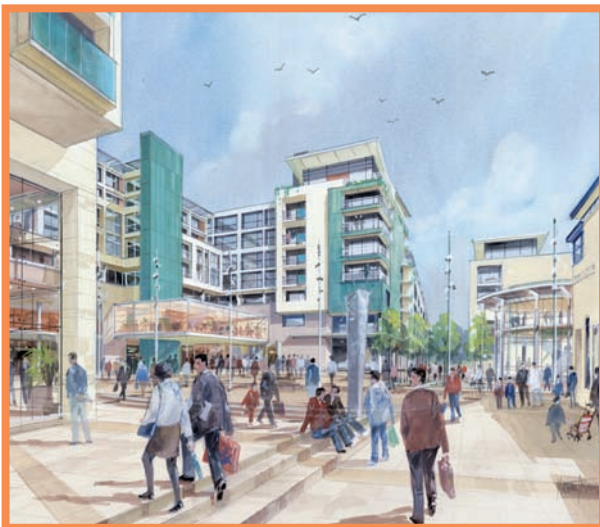
Central Town Square

Linked to Library Square, planning permission has been granted for a major new square at the heart of the Town. The major new Town Square is focused on the civic precinct that includes the library, arts centre, County Hall and theatre buildings on one side, and a permitted extension to 'The Square' shopping centre on the other. In addition to retail development, the extension includes cafes/restaurants and the relocation of the existing multiplex cinema onto the Town Square, together with office and residential accommodation above.