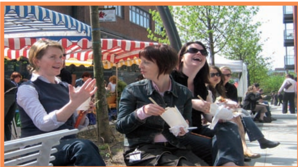
High Street Market

Whilst much has been achieved and is evident on the ground, there is more to come. In order to build on success to date, South Dublin County Council adopted a Masterplan (Tallaght Town Centre Local Area Plan 2006), to provide for the development of new streets, civic and amenity spaces and a range of people-intensive uses appropriate to a town centre based on high quality urban design.