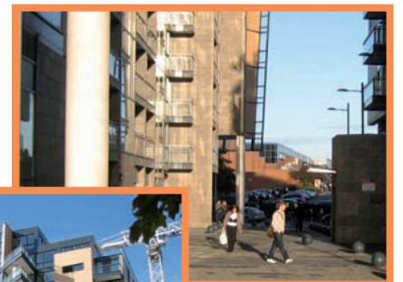
Belgard Square Walk

The Council is completing a new urban walkway, known as the 'Tallaght Zip'. This is designed to pull together the western and eastern parts of the Town. The Zip comprises a widened high quality pavement with features such as seating and mature planting and provides greater pedestrian priority where it crosses existing roads. Importantly, the Zip link the Luas terminus and Town Centre Squares with the ITT and Old Village. (Image on cover)