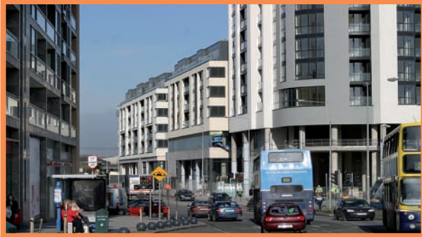
Belgard Square West

An integral part of the successful implementation of the Tallaght Integrated Area Plan (IAP) has been the creation of new urban public space on previously greenfield sites, roads and car parks in Tallaght Town Centre. The challenge has been to create the streets, square and walks that make the heart of a Town of 100,000 people, in most cases where nothing has existed before.