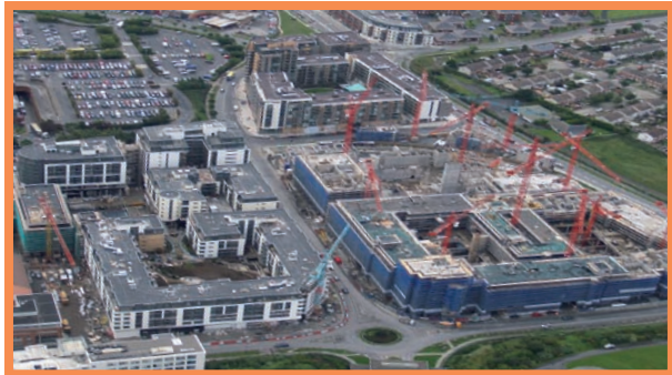
Tallaght Town Centre 2007