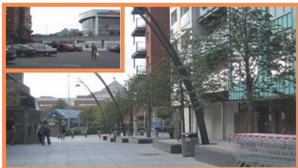
Before and After: High Street

The extent of change has been such that a new Town Centre street and space naming project has been initiated in order to properly reflect the character and diversity of the emerging Town.