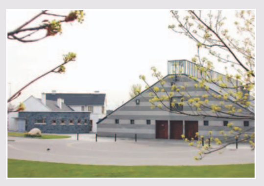
Liscarne Centre in Neilstown, Clondalkin

Existing Council tenants were not forgotten. 700 houses have been upgraded in terms of insulation and energy usage. All South Dublin Council homes now have central heating installed. 130 have been re-wired and the servicing of 3,000 tenant-installed gas heating systems was also commenced. An extensive window replacement programme commenced in 2006.