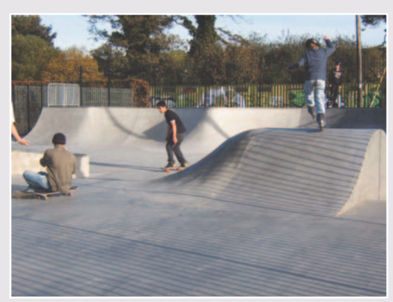
Skate Park at Lucan

The response from teachers is very encouraging; they see the initiative of the CARE Programme as a perfect complement to the required environmental element of the school curriculum.