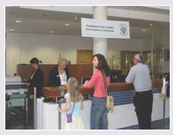
Customer Care Centre, County Hall

councillors which would like to be contacted directly in relation to any matters relating to Irish and SDCC was developed from this address, and is being updated regularly.