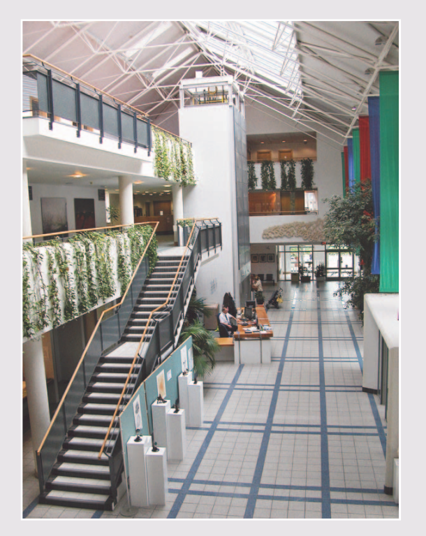
County Hall, Tallaght

2006 also saw a large increase in the area of Litigation with increased activities in the area of enforcement pursuant to legislation governing Waste Management, Anti Social Behaviour, Planning, Housing, Liquor, Control of Dogs and Litter Pollution.