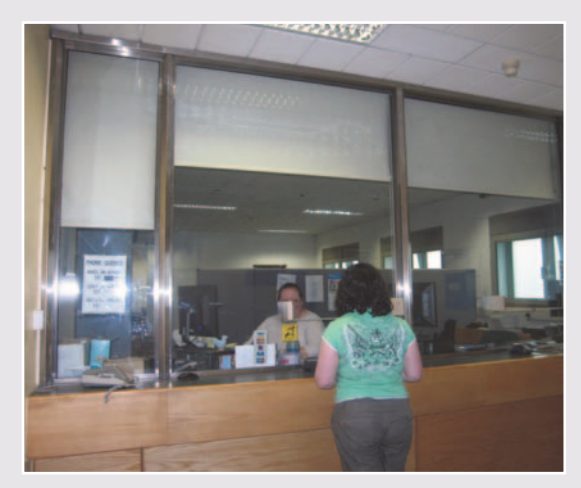
Cash Office at the County Hall