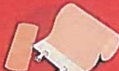
BAND-AIDS & PLASTERS