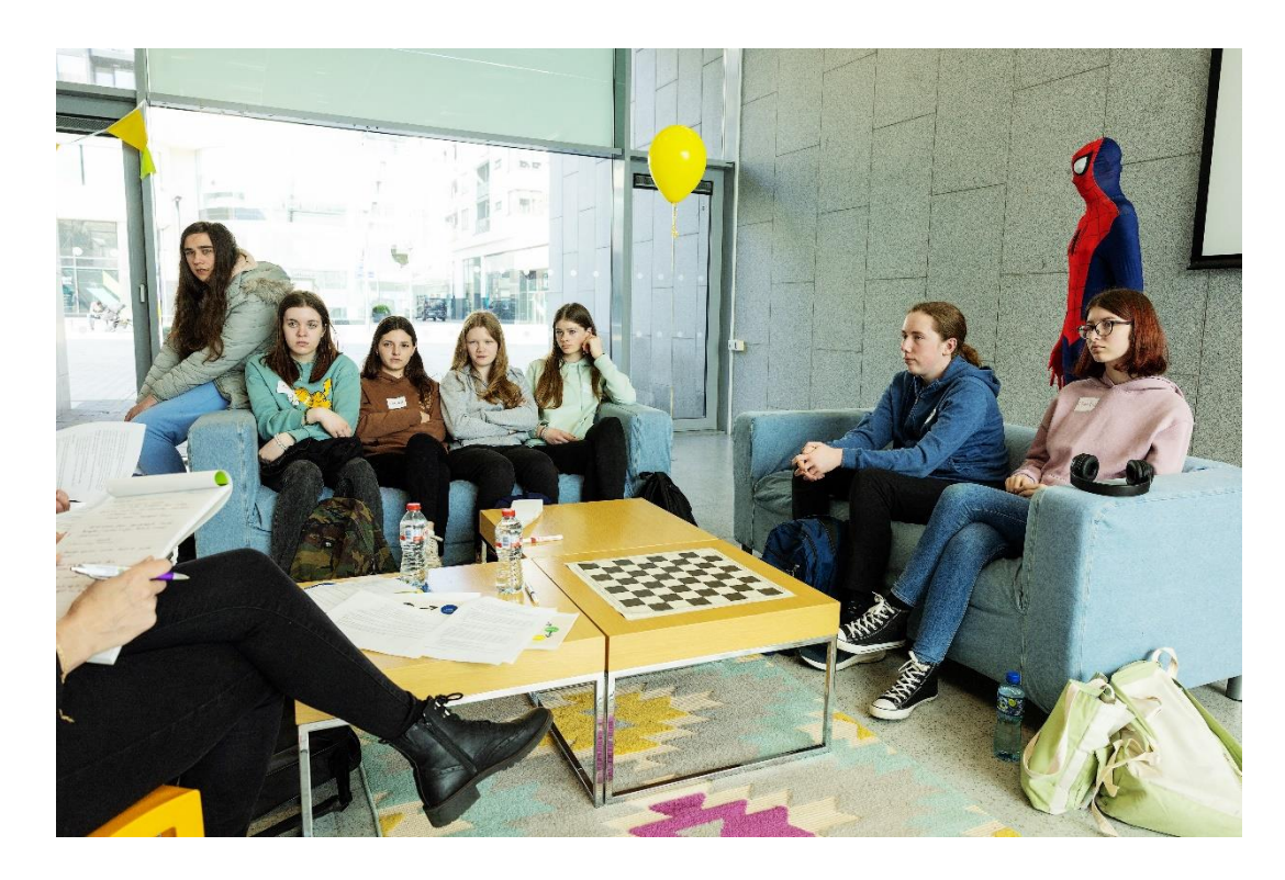
Community Spaces, Services and Supports