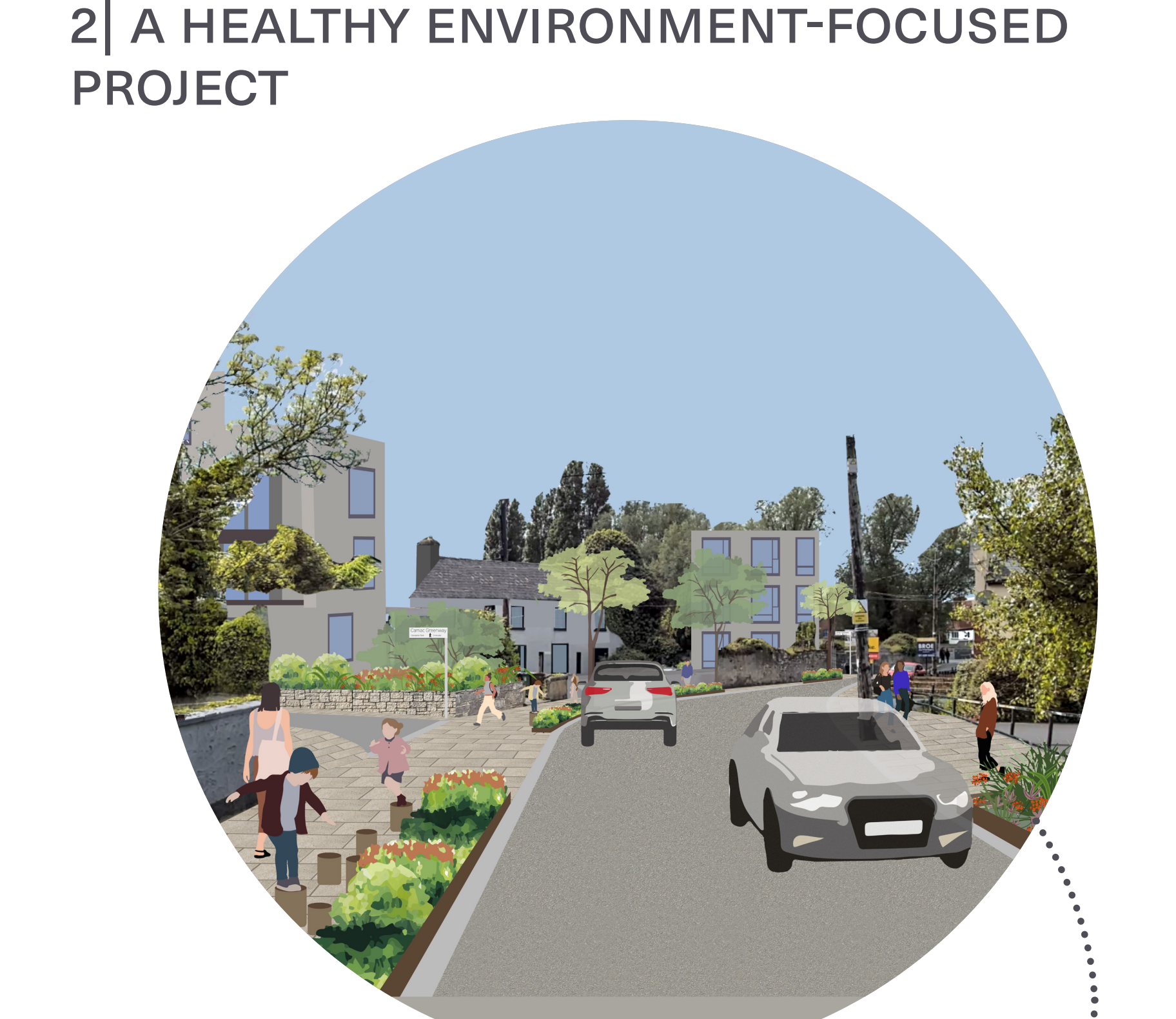
Clondalkin Park Entrance on Old Nangor Road

Provide a safer and improved gateway to the Town Park, through more appropriate built form and activity used to support a safer and easier pedestrian experience. Enhanced riparian and ecological setting of the waterways and millponds.