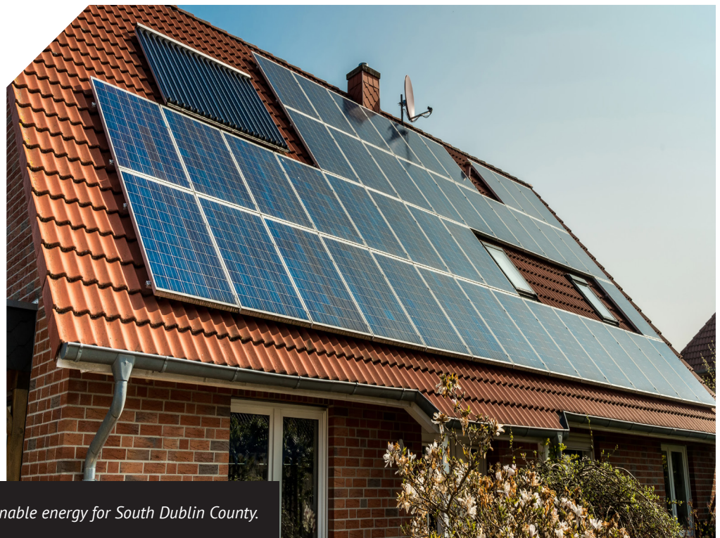
Sustainable energy for South Dublin County.

The plan is submitted in February of each year and reviewed by the EPA who publish an annual report on national performances.