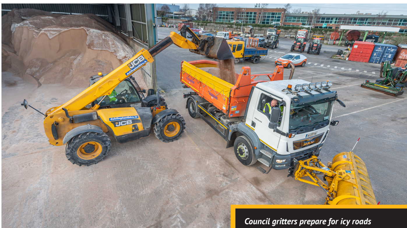
Council gritters prepare for icy roads