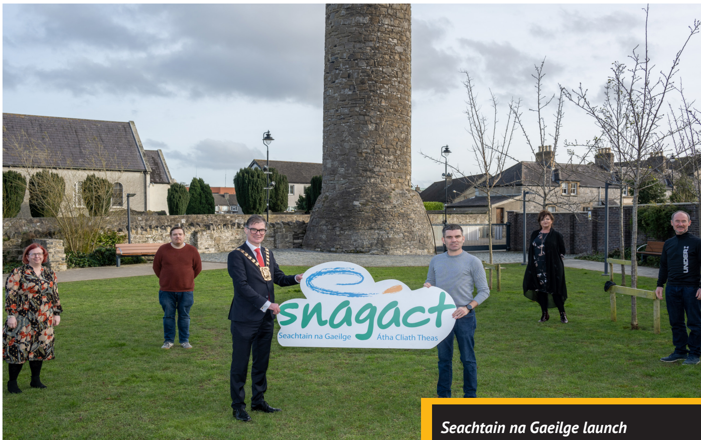
Seachtain na Gaeilge launch