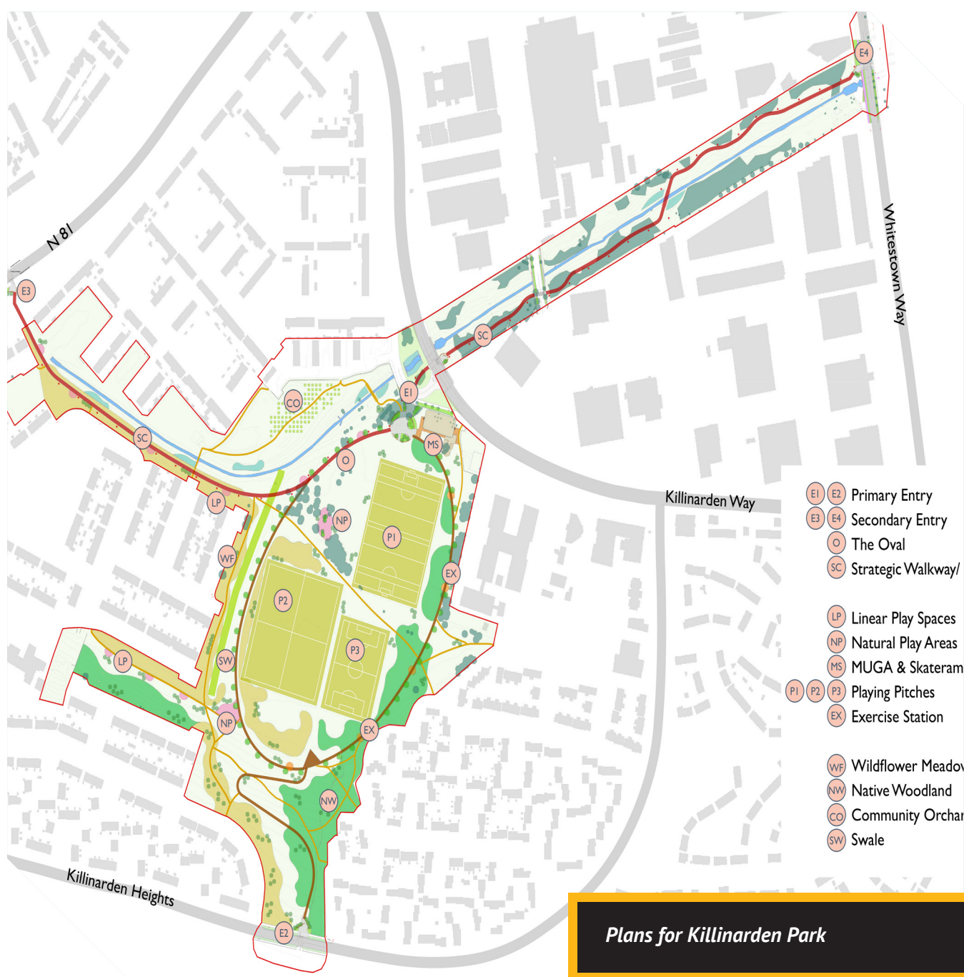
Plans for Killinarden Park

The design for the park incorporates the introduction of diverse habitat types, enhanced park entrances, up-graded boundary walls and railings, a lit strategic walk/cycle path along the Whitestown stream, two new bridges across Whitestown Stream, a primary oval footpath connecting park facilities which can also double up as an exercise circuit of approx. 1km, linear play trails, two natural play areas, seating, multi-games use area with a skate ramp and social space.