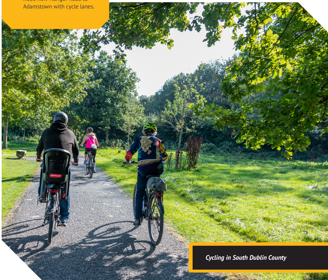
Cycling in South Dublin County

and the development of sustainable transport options in South Dublin County. This is very good news for our communities, and I am excited to see these projects begin to change how we get to work, schools, friends and family when our county reopens."