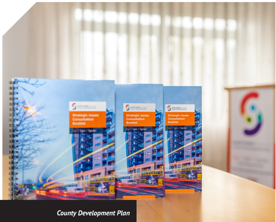
County Development Plan

Since the introduction of the Strategic Housing Development (SHD) legislation, An Bord Pleanála (ABP) has permitted a total of approximately 7,360 units in 17 SHDs in the County. During 2020, the Council has contributed to the assessment of nine SHD planning applications lodged to ABP over the year. These applications included proposals for 2,949 units. Of these SHDs considered in 2020, ABP has made decisions on seven applications, permitting 2,389 units. The two further SHD applications, totalling 560 units, still await decision from An Bord Pleanála.