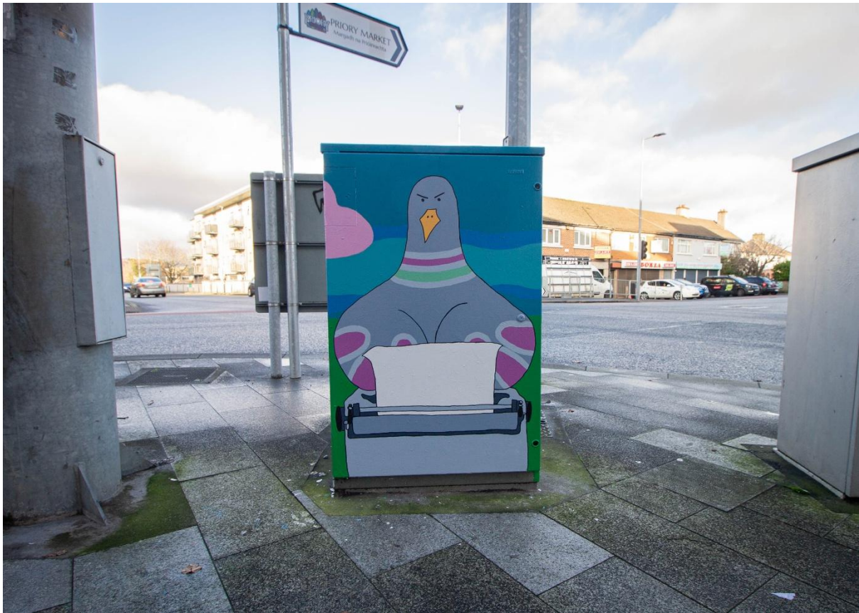
'Intruding, AGAIN?!' by Anna Becevel. Greenhills Road, Tallaght Village, Tallaght, Dublin 24.