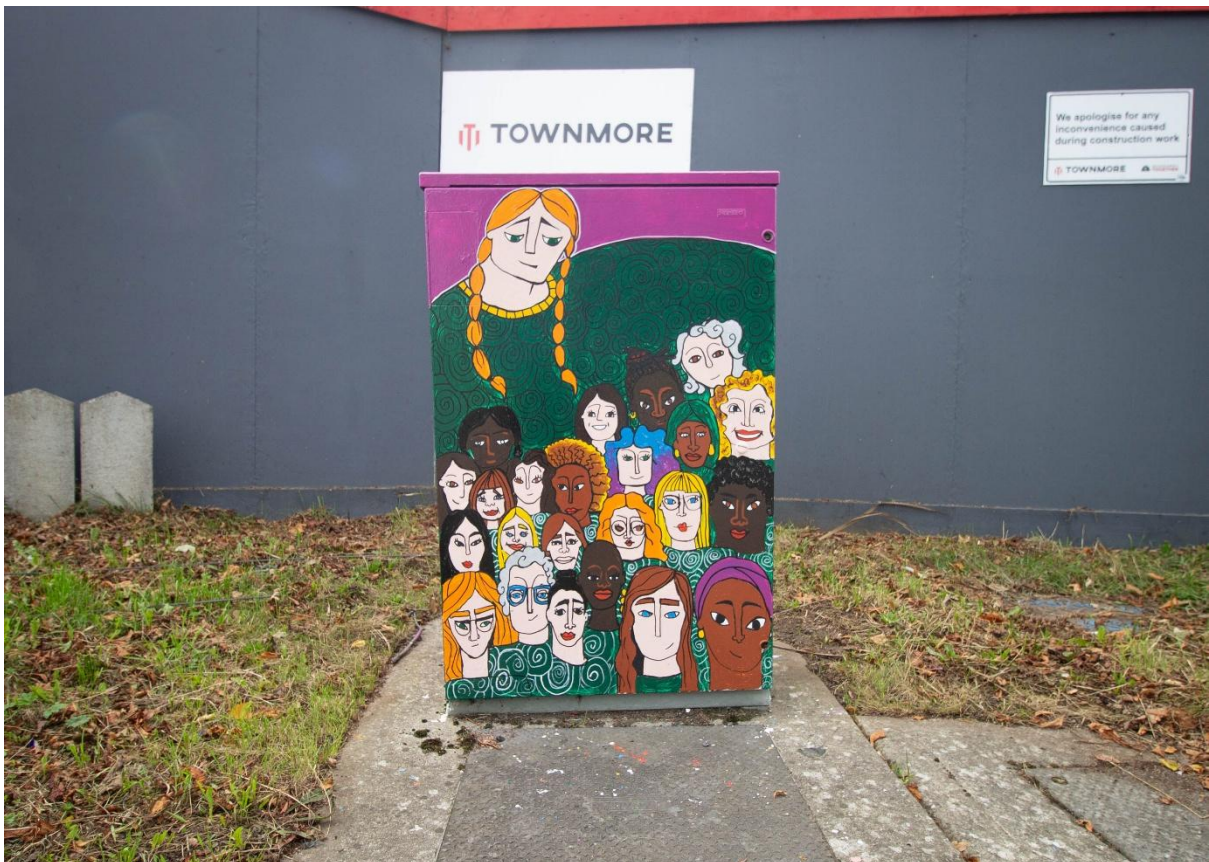
'Ireland's Daughters' by Sinead Poznanski. Firhouse Road, Ballycullen Road, Ballycullen, Dublin 16.