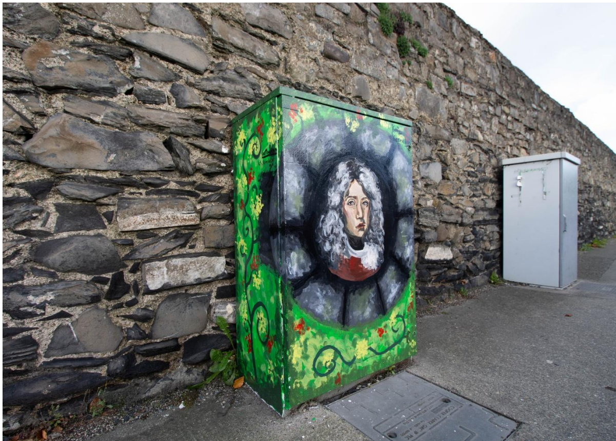
'The Oculus' by Katy Kennedy. Lucan Road / Chapel Hill, Lucan, Dublin.

The project transforms previously unused public spaces into canvases, brightening up each area and making Dublin a more beautiful place to live, work and visit