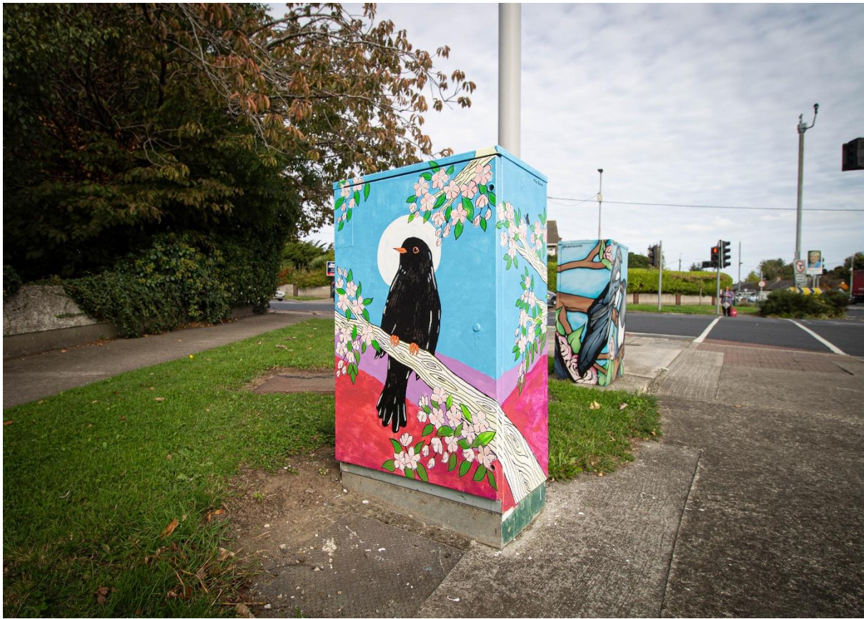
'Blackbird Cherry Blossoms' by Maria Kavanagh. Cyprus Grove, Templeogue Road, Templeogue, Dublin.