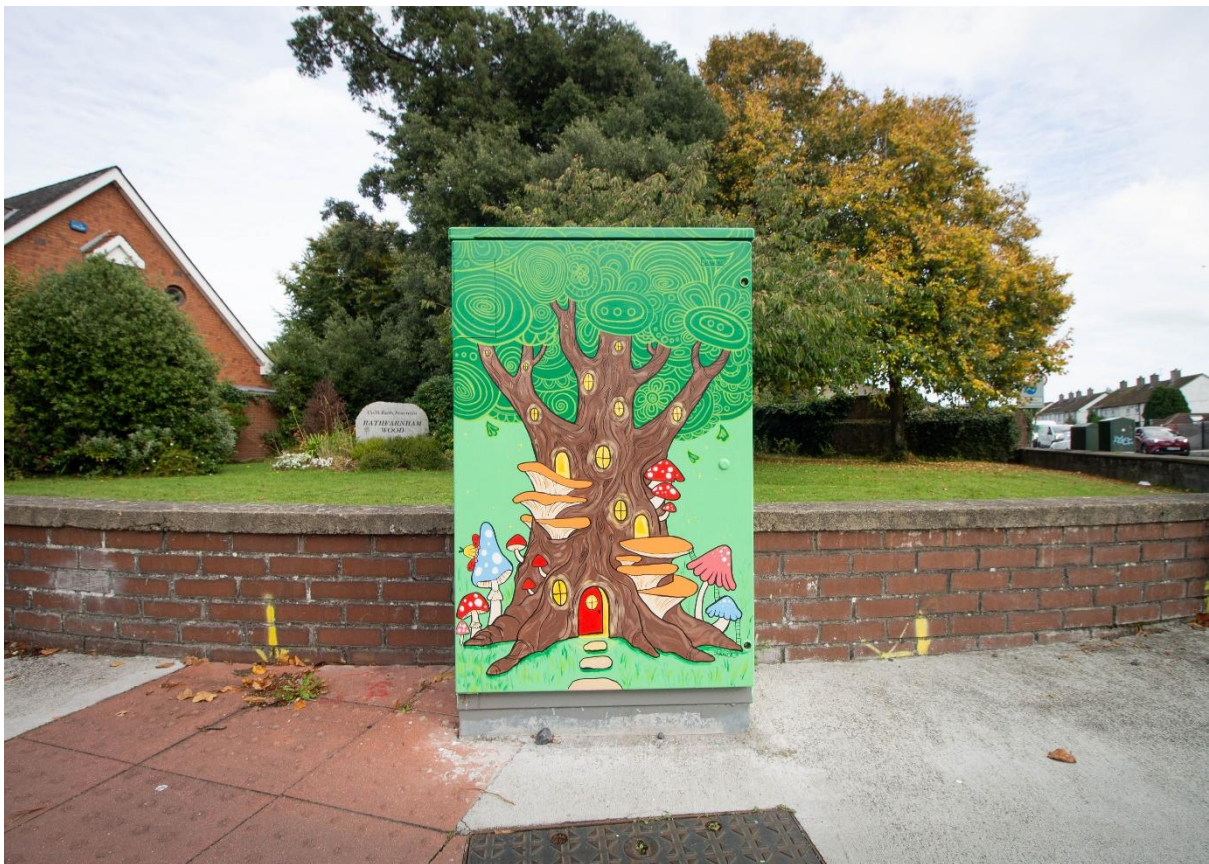
'Fairy Tree' by Shauna O'Reilly. Grange Road / Nutgrove Ave, Rathfarnham, Dublin 16.