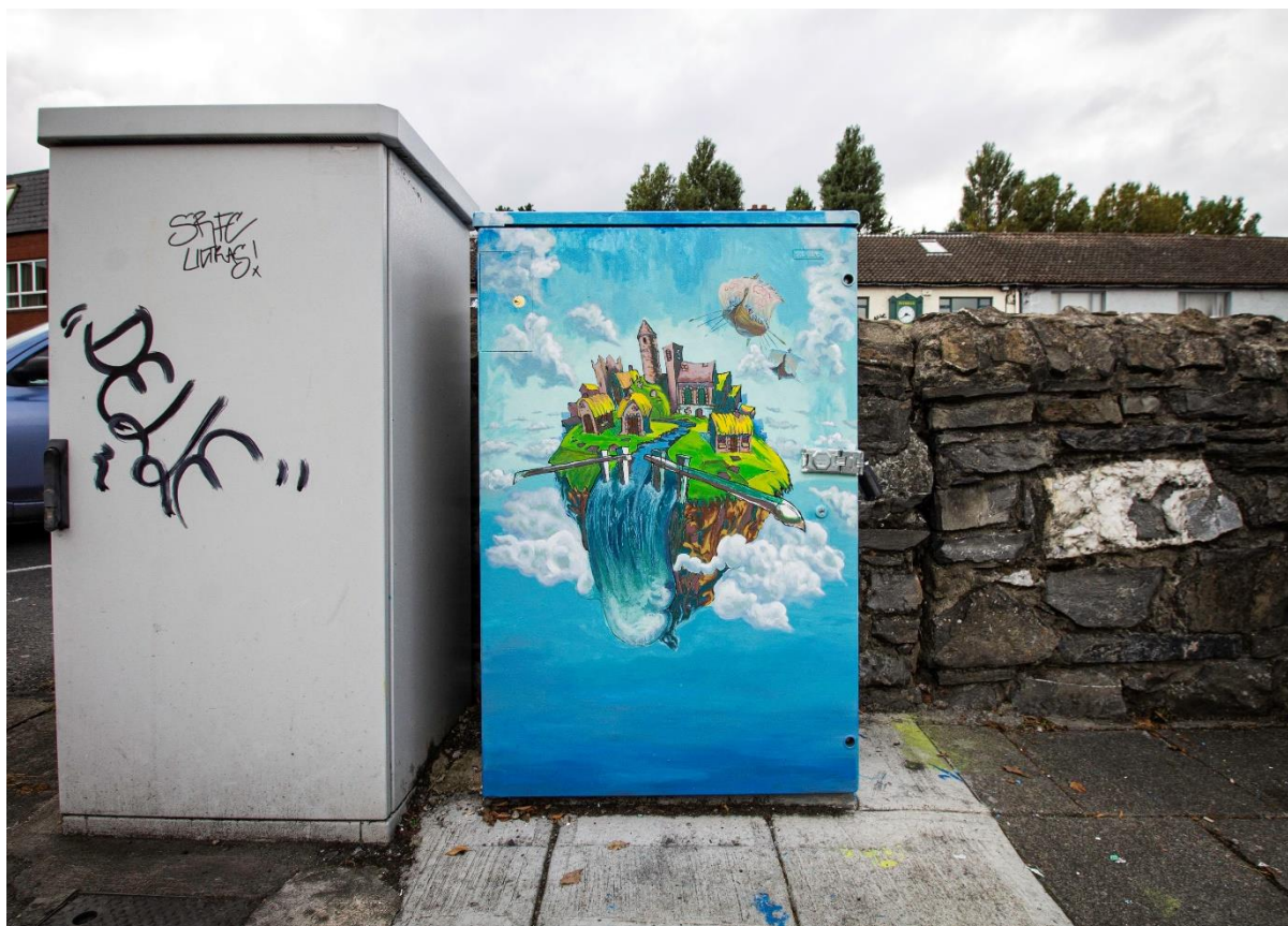
'Tower Island' by John Tynan. Tower Road, Convent Road, Clondalkin Village, Dublin. (2021)

Dublin Canvas is an idea, a public art project intended to bring flashes of colour and creativity to everyday objects within County Dublin. Less grey, more play! The project takes previously unused public space and transforms it into canvases to help brighten up each area. Making Dublin a more beautiful place to live, work and visit.