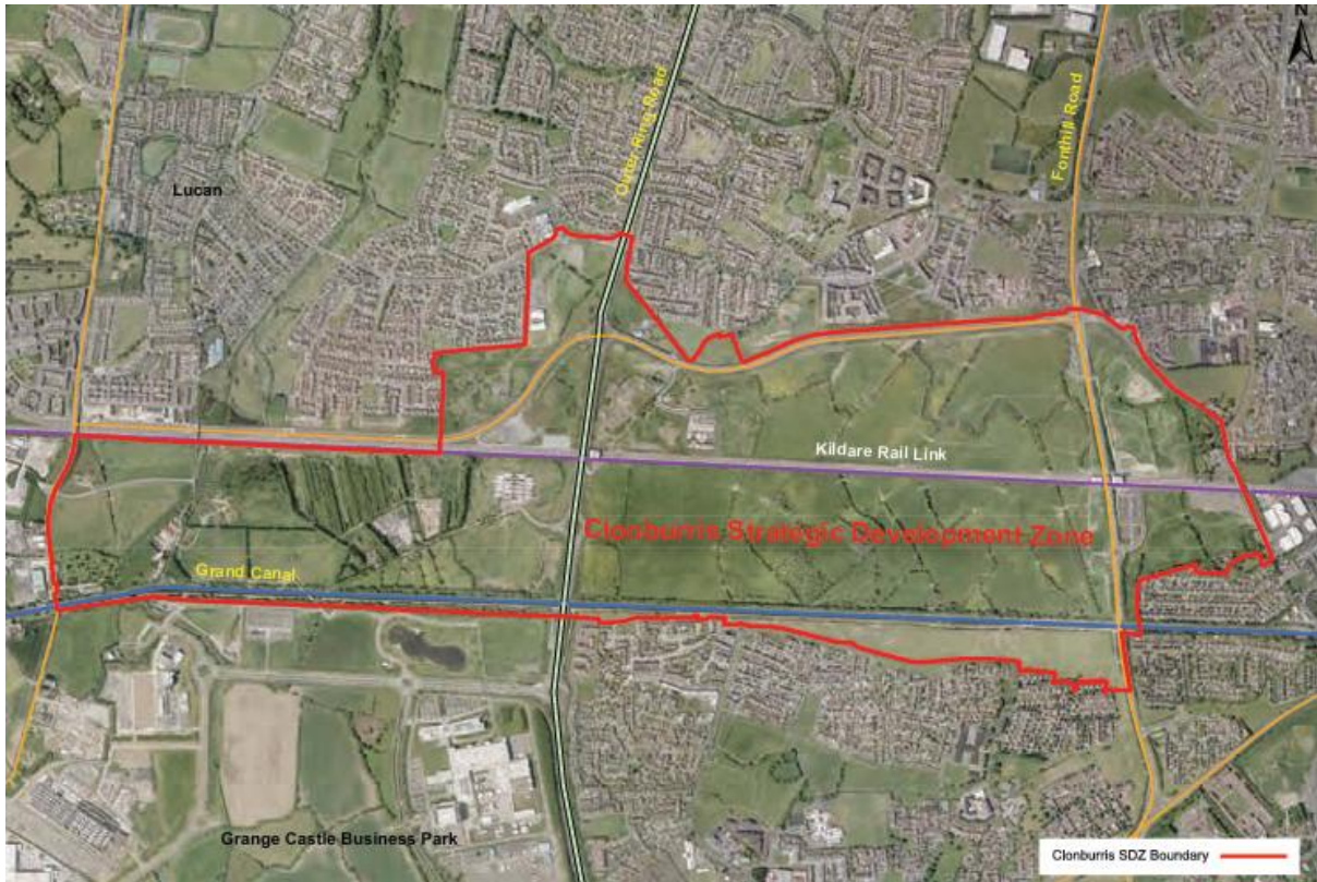
Figure 1: Clonburris SDZ boundary