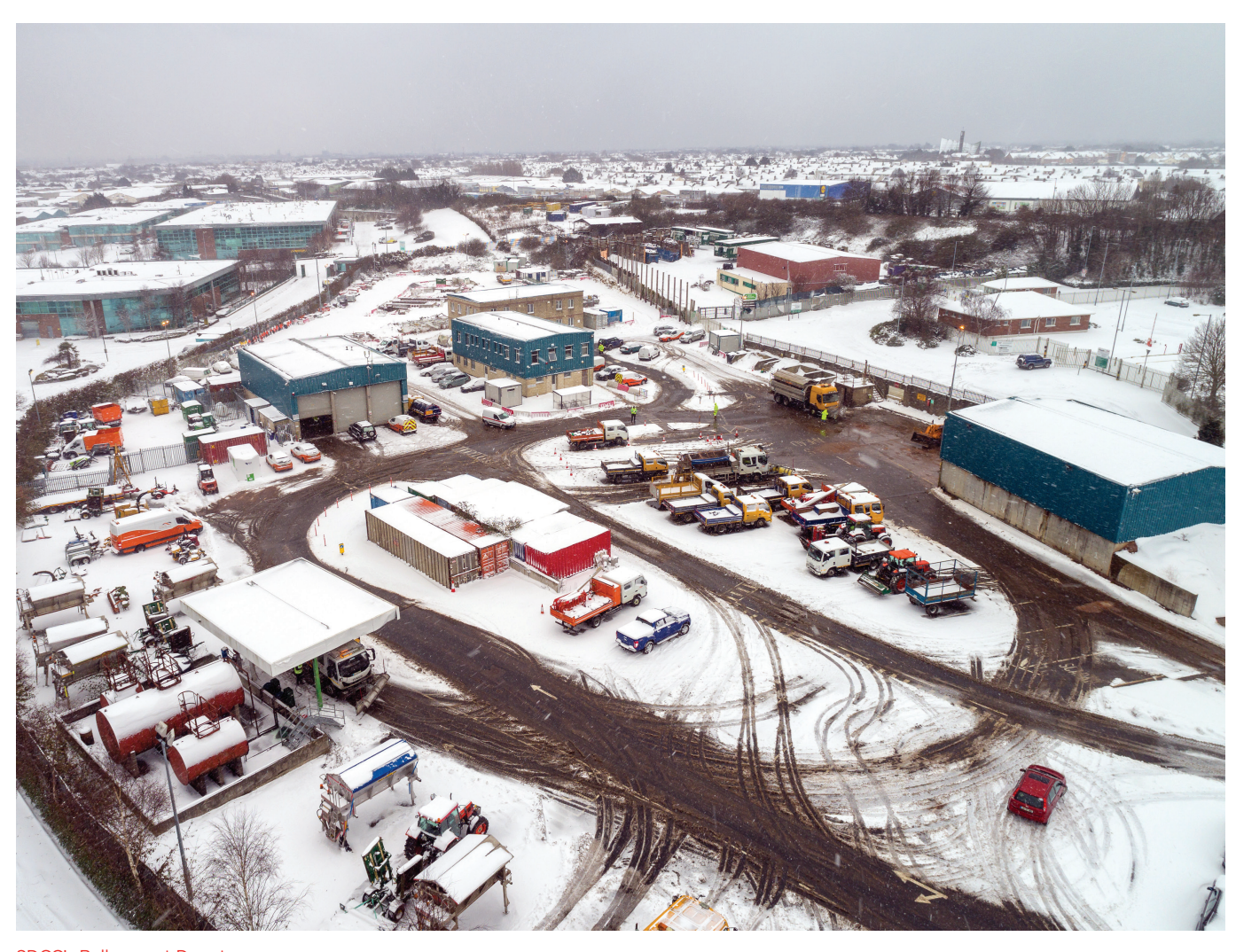
SDCC's Ballymount Depot

South Dublin County Today South Dublin County Council 4