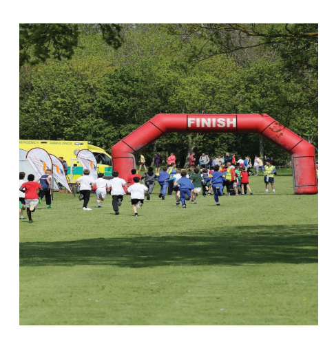
Schools Cross Country Final

The Schools Cross Country series is about getting children active and enjoying athletics. Schools engage with the series 100%, and offer training before and after school and the pupils take it on themselves during some of their lunch breaks. The demand for this race series starts in September with schools contacting us to see is it on in February.