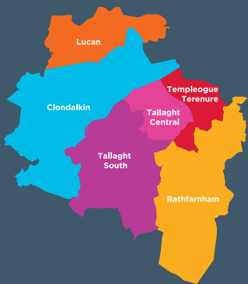
Elected Members Map