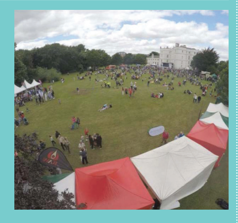
Rathfarnham Castle Park

Visitors and locals alike are encouraged to come along and try some of the gourmet cuisine and delectable tastes. The festival will feature flavours from around the