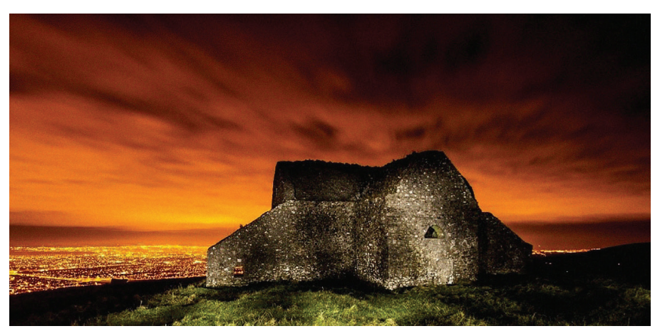
The Hellfire Club, Montpelier Hill