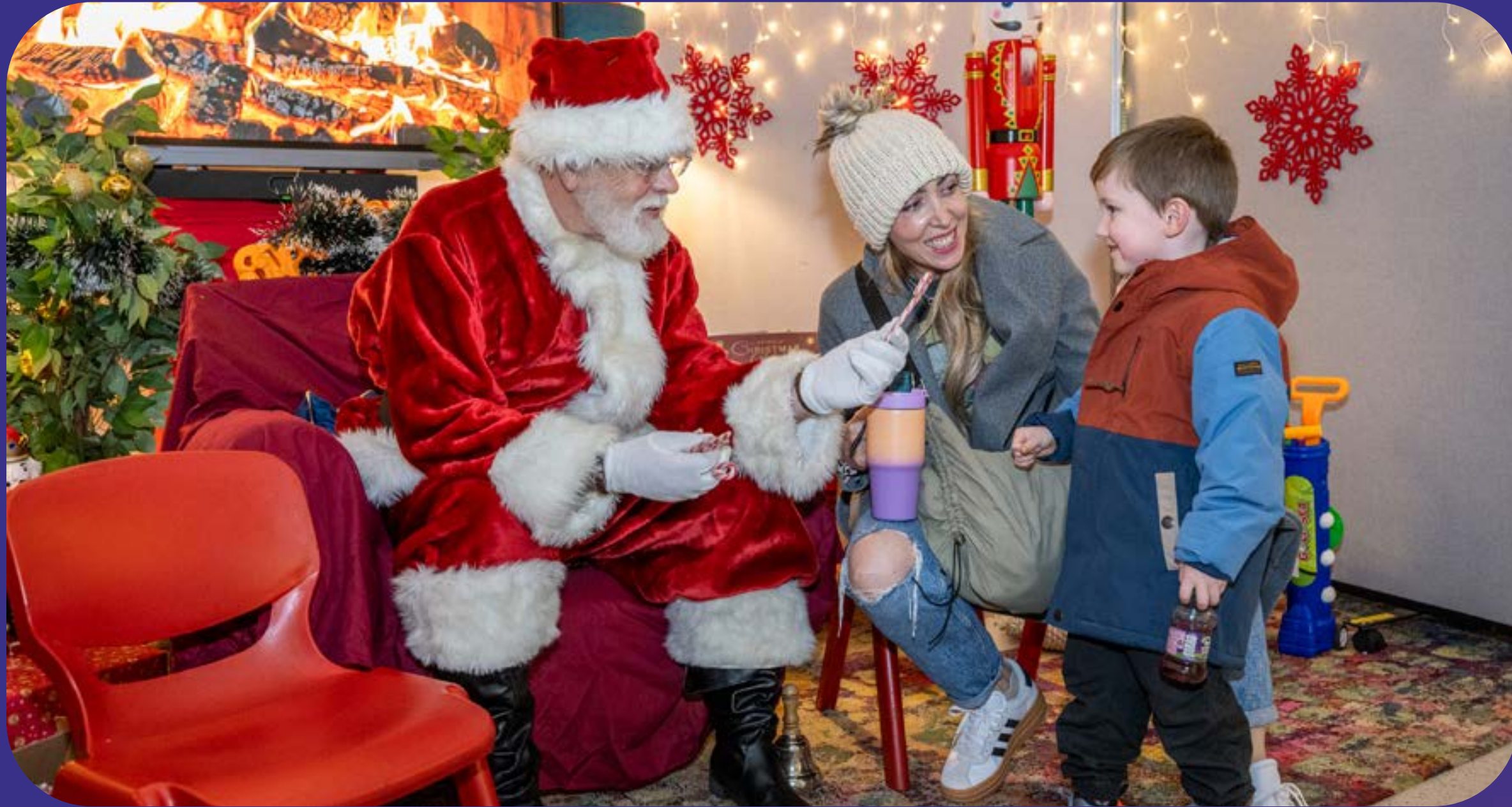
Christmas Market at Tallaght Library