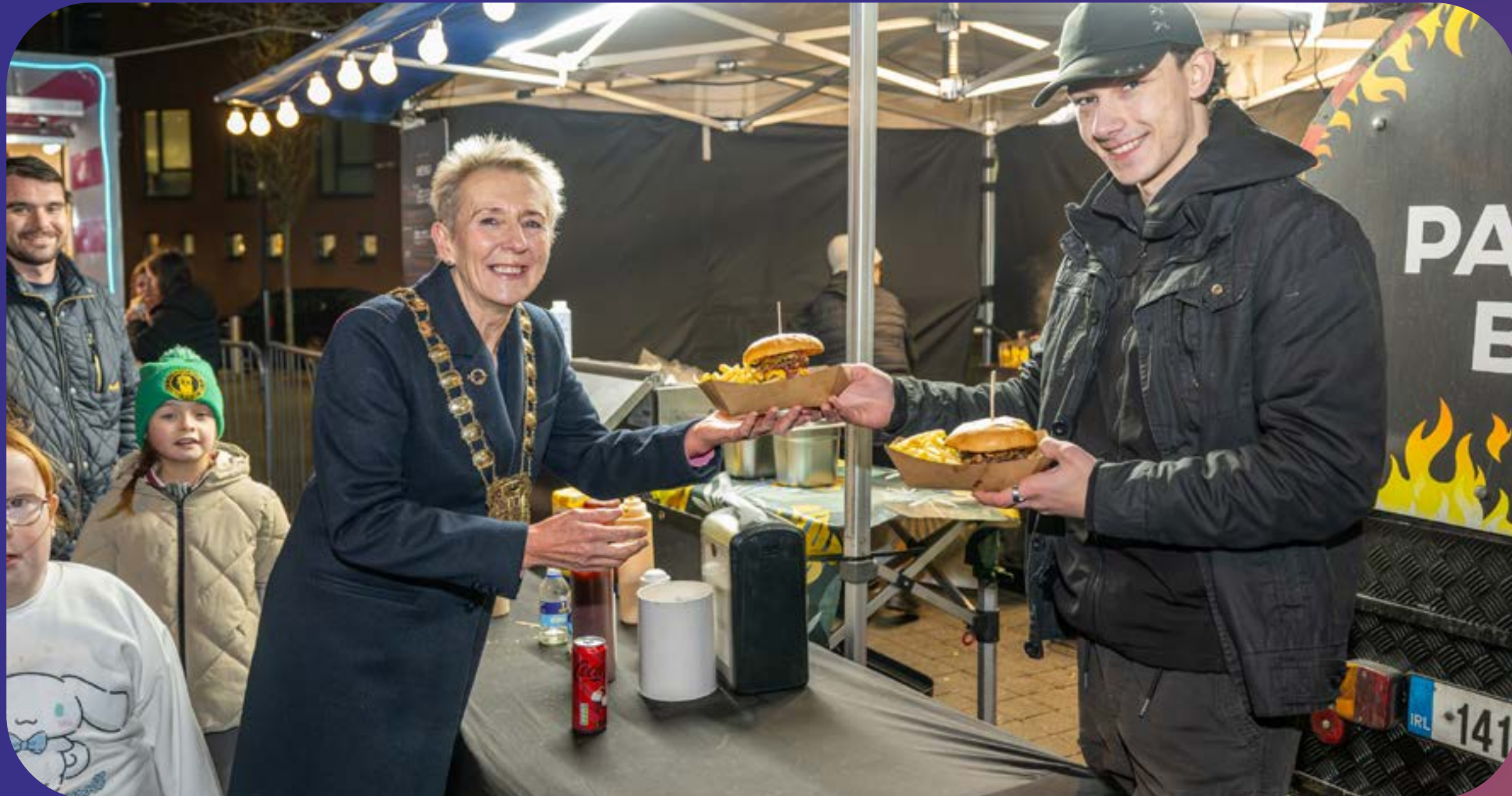
Christmas Tree lighting in Clondalkin