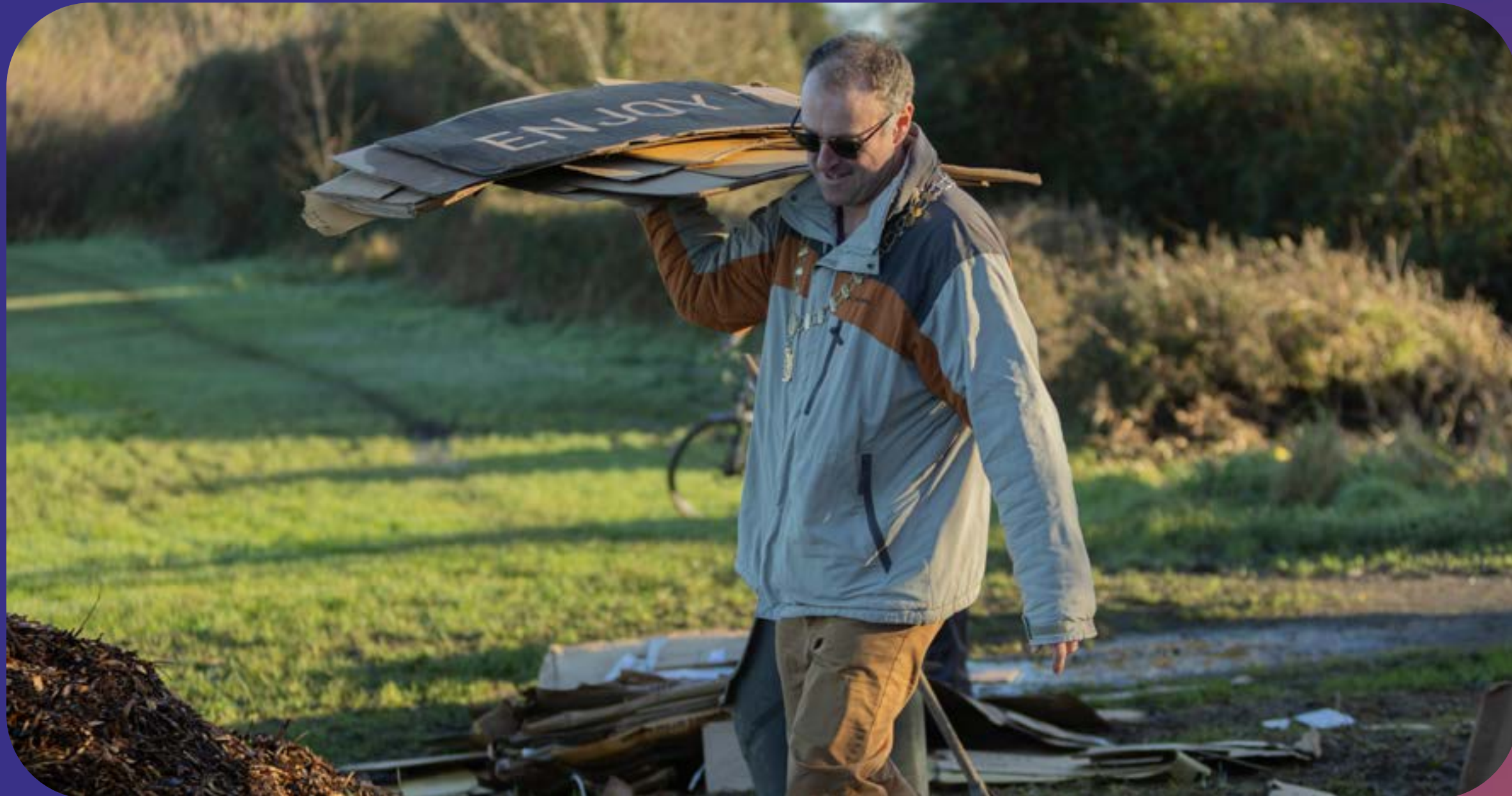
Mini woodland planting in Firhouse