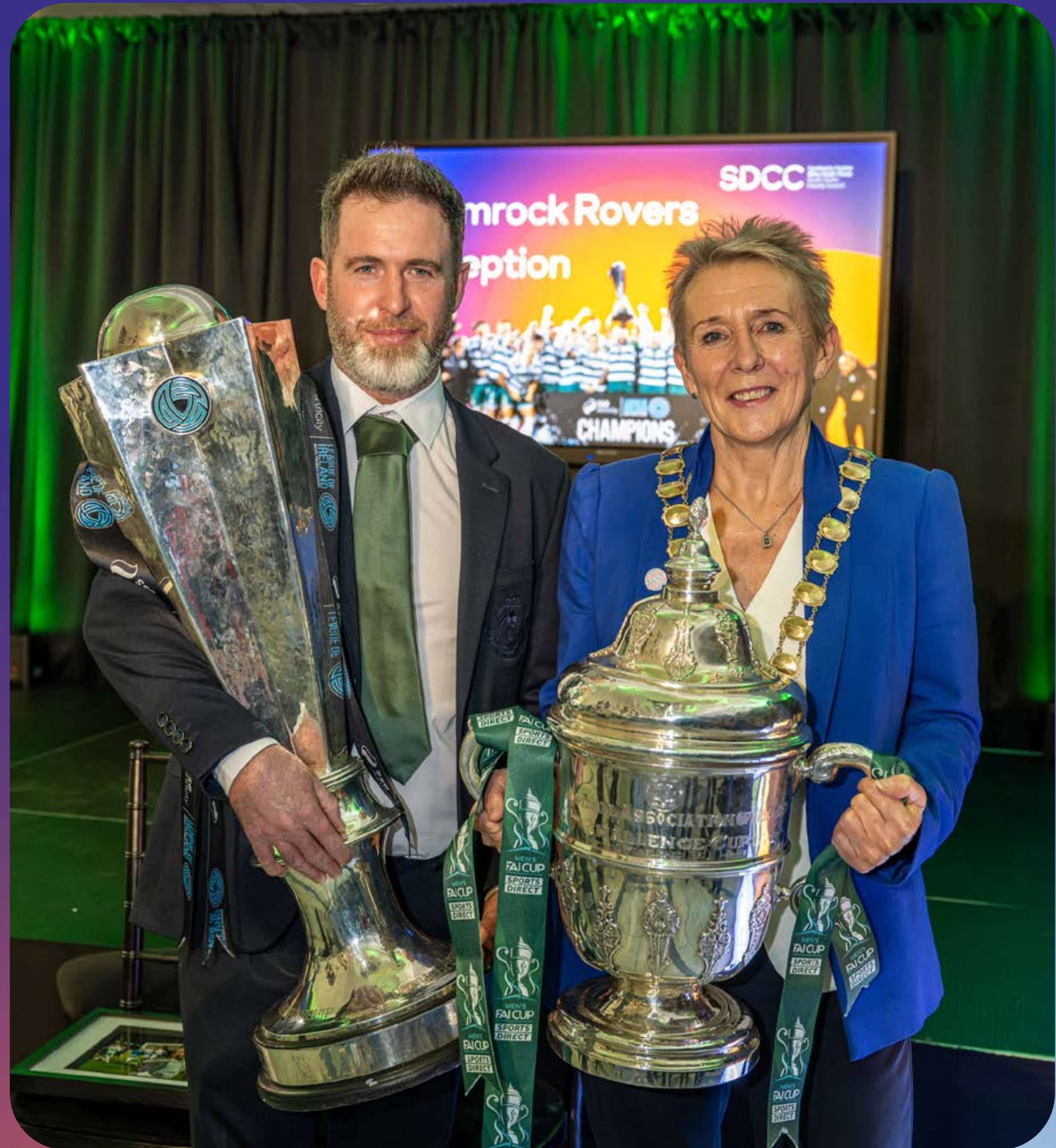
Reception for Shamrock Rovers at County Hall