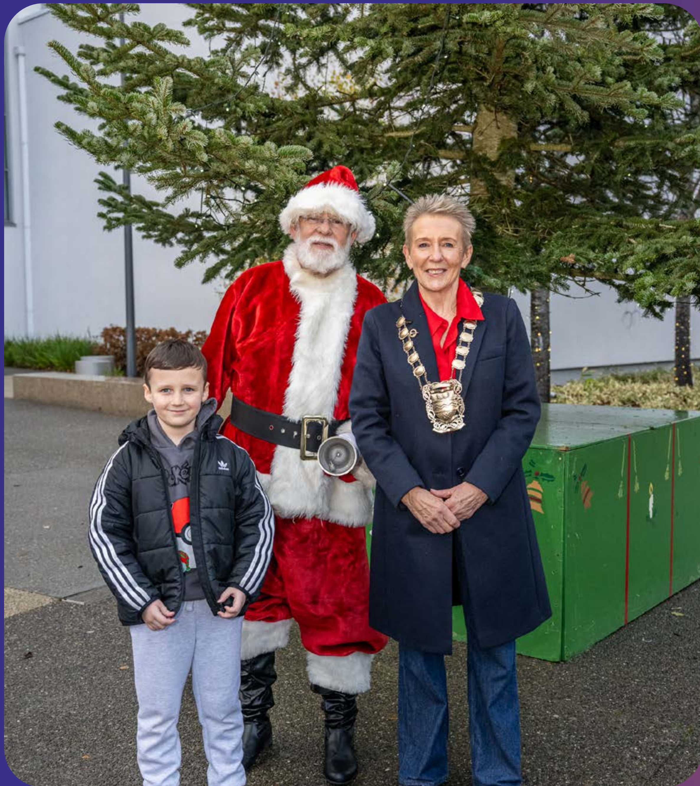
Lighting the Christmas Tree at County Hall Tallaght