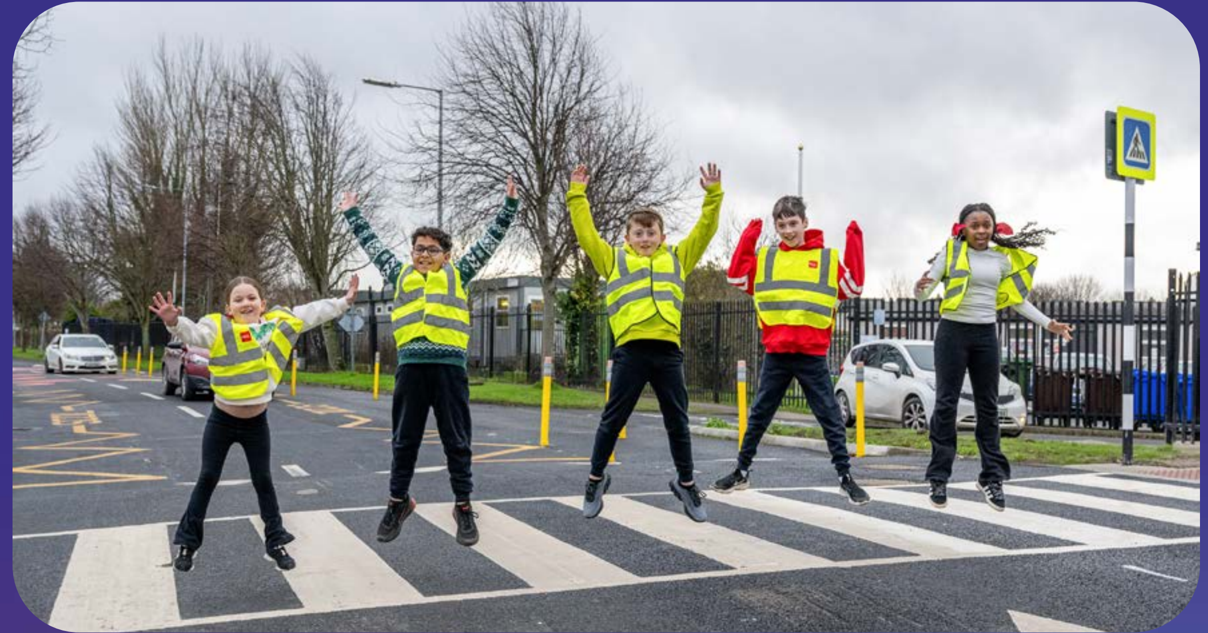
School Safety Zone at St Ronans NS Primary School in Deansrath, Clondalkin