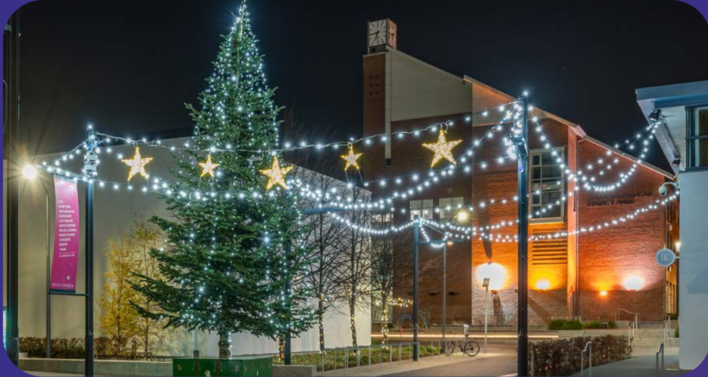
Christmas Tree at County Hall Tallaght