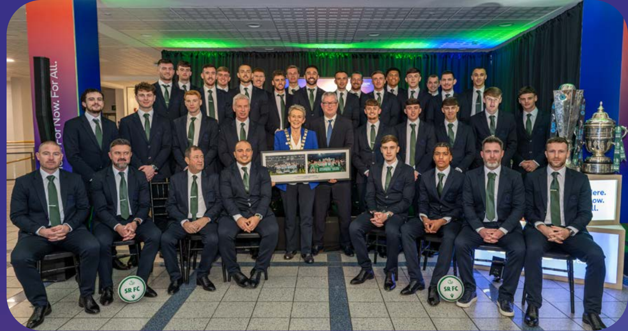
Reception for Shamrock Rovers at County Hall