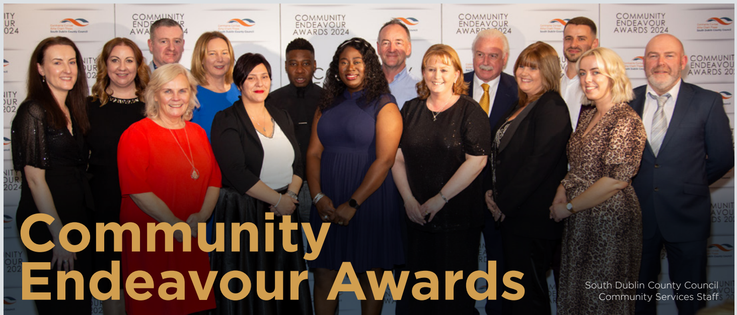
South Dublin County Council Community Services Staff

The 2024 Community Endeavour Awards were held in the Plaza Hotel on 3 October. The awards recognise and reward community effort and achievement.