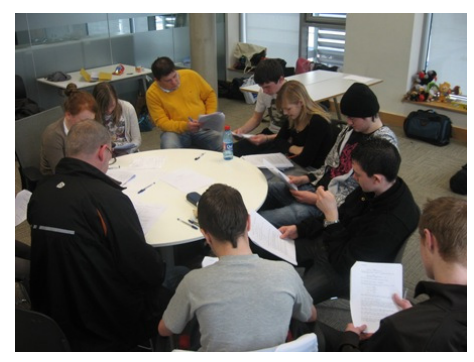
Reviewing script of 'Spooked', April 2010

The following report describes the activities in which the Tallaght Young Filmmakers have taken part from April 2009 – April 2010, with a break during weeks in August and September. Five different stages of work took place during this time, which are detailed in Table 3.