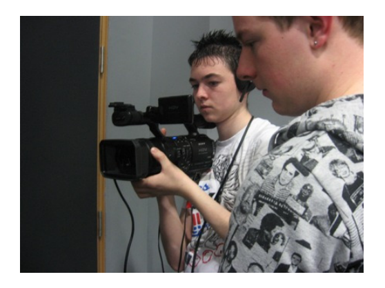
TYF Director and Camera Operator filming 'Spooked', April 2010

The group set out to make a five minute film, however the film created, entitled 'Spooked' is a 9 minute, 50 second horror film in which two siblings go with friends to a building, which one believes to be haunted. Ideas were created over three days of sessions with the filmmaker/mentor, with a pre-production meeting and shooting occurring over four days in the following week. Post production is currently underway. Monitoring and Evaluation has been carried out throughout the project.