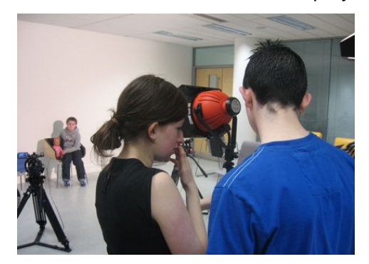
On set, filming a documentary, December 2009

The editing master classes helped participants gain insight into the editing process, and more specifically what may need to be considered from an editing perspective during a film shoot, itself. As the classes occurred just after the winter holiday, the sessions gave participants time to get reacquainted to the group's regular meeting schedule, as often after periods of break time, groups can take a couple of weeks to get started back up. The workshops also introduced participants to another side of filmmaking. From this experience there are at least two members of TYF who are keen to learn more about the technical side of the editing process in order to be more involved in it for future film projects.