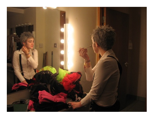
Getting into Character, Sweded TV, July 2009

'We saw the [two Sweded films]. It was a great achievement for all involved and terrific to see such talent and confidence. Thanks so much ... for all the work ... put into the Tallaght Young Filmmakers. [Our son] really enjoys it all and it is a wonderful added bonus that the young filmmakers compliments the course he is following in Galway. Keep up the good work!'