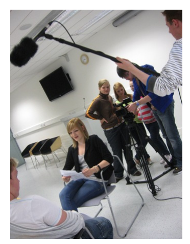
Practicing interview techniques for camera, September 2009

In preparation for the project, Shane Hogan and Tom Burke of Areaman Productions met the group in early October to discuss the creation of their series of documentaries entitled 'The Liberties'. The aim of