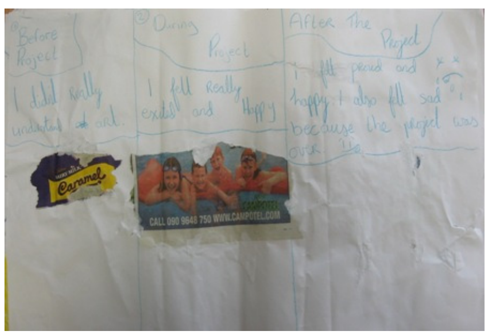
Evaluation Feedback from young participants