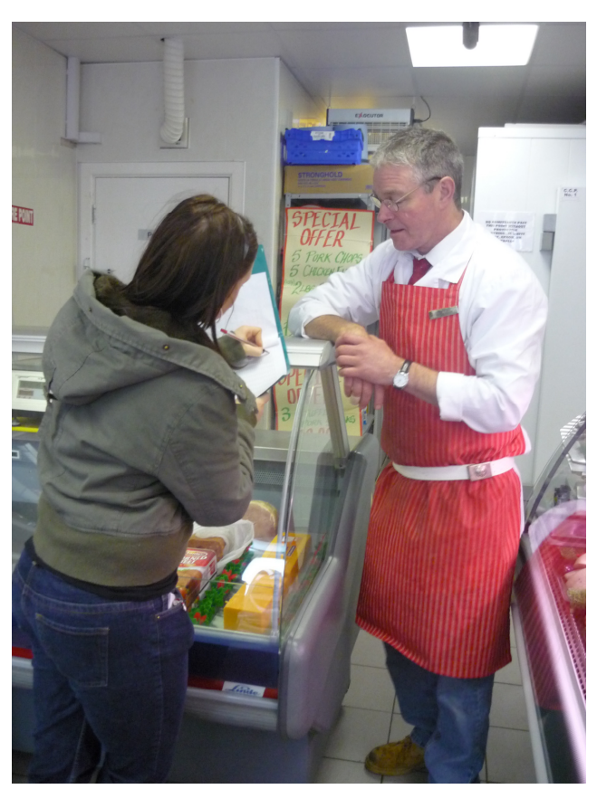
Young participant conducting research in the community

A timeline of project delivery is provided in Appendix A.