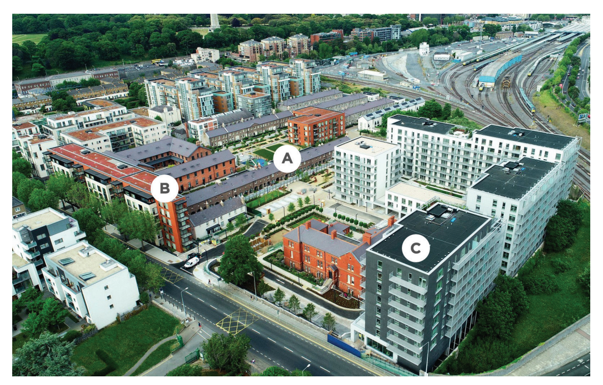
Contextual Heights at Clancy Quay Dublin - the 8-storey Building C can be expressed as a contextual height ratio of 4xCH relative to the historic buildings A or 1.25xCH relative to the newer development at Building B.

The context driven approach to height in the County will be based on and informed by the receiving environment and surrounding built form having regard to the provisions of South Dublin County's BHDG and in particular the Contextual Analysis Toolkit. The presence of permitted development(s) in the surrounds, whilst a planning consideration, does not on its own, connote an emerging context of increased heights or a precedent for individual increases of development heights.