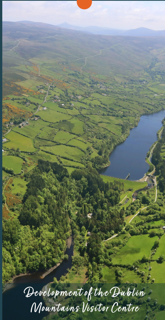
Development of the Dublin Mountains Visitor Centre