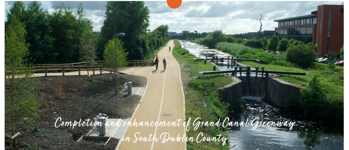
Completion and enhancement of Grand Canal Greenway in South Dublin County