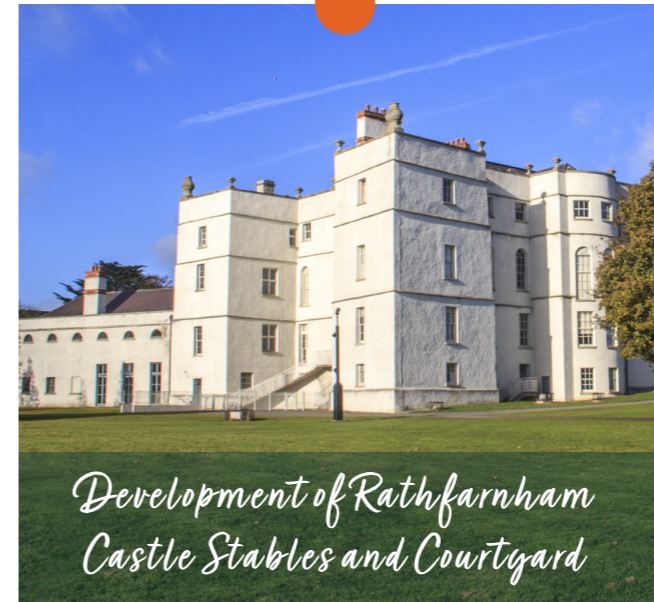
Development of Rathfarnham Castle Stables and Courtyard