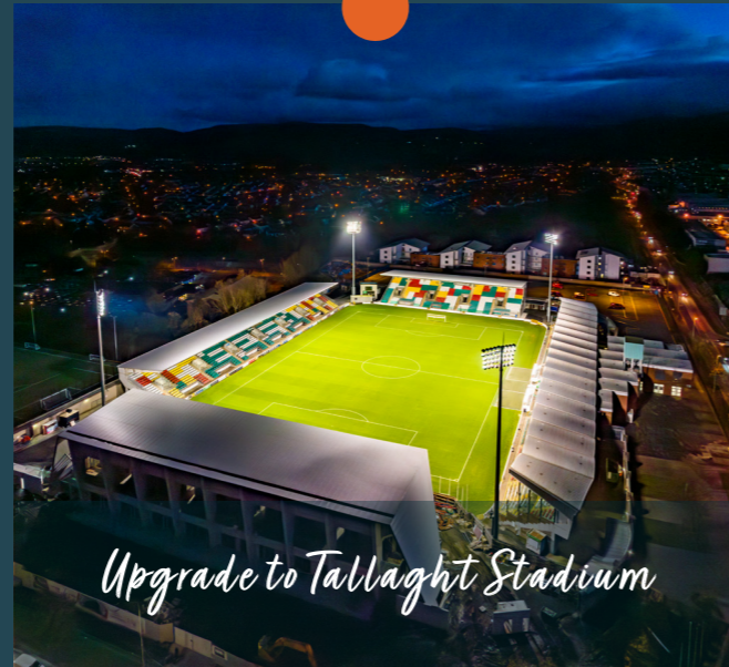
Upgrade to Tallaght Stadium