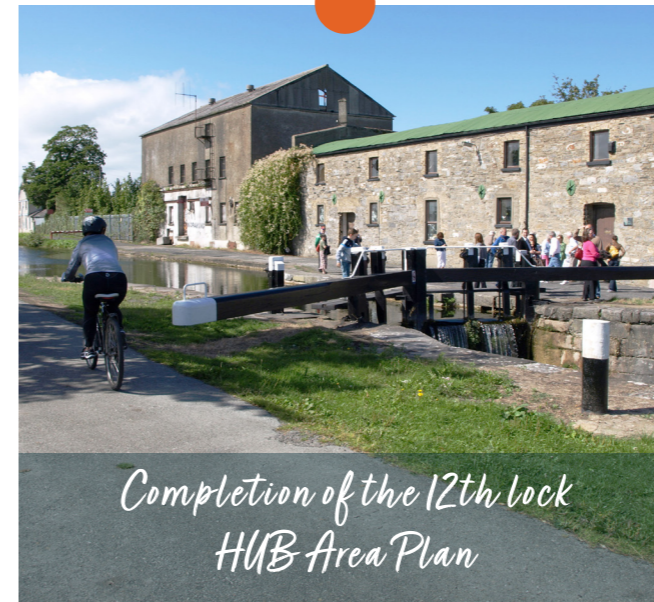
Completion of the 12th lock HUB Area Plan