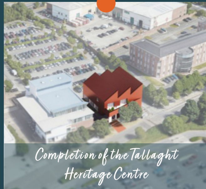
Completion of the Tallaght Heritage Centre