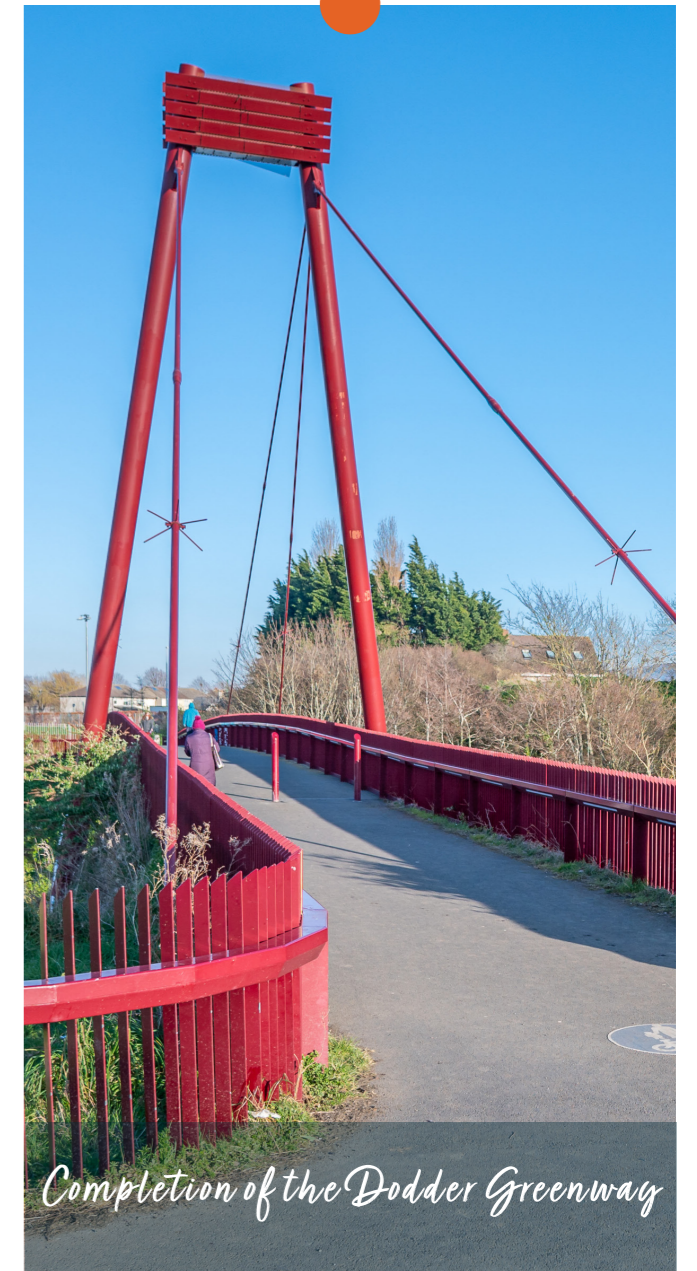
Completion of the Dodder Greenway