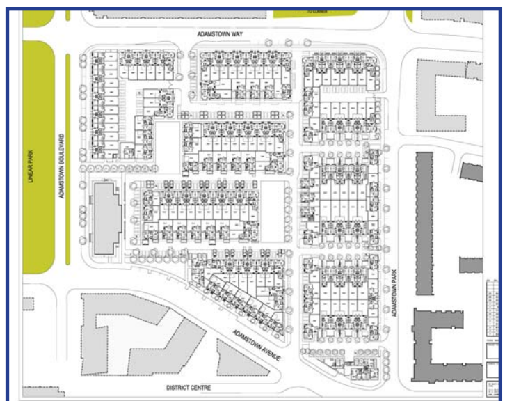
Proposed revised layout for Adamstown Square 3 area

Pre-planning discussions are ongoing with Maplewood Development to revise Phase 2A (SDZ07A/0001) and 2B (SDZ08A/0005) of The Paddocks. This is likely to result in an increase in the number of individual family houses, and a reduction in the number of apartments permitted.