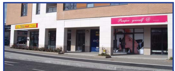
New retail units occupied during 2010 within Sentinel Building

The Adamstown Castle Sentinel Building is a mixed use building, located at the junction of Adamstown Avenue and Station Road and comprises 4 retail units. In September 2009, a Londis convenience store opened in the Sentinel Building.