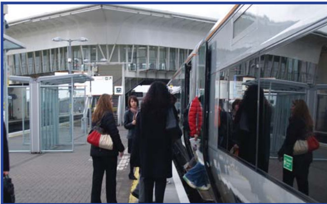
Adamstown Railway Station during morning peak times

Further information on Iarnrod Eireann Train services are available on www.irishrail.ie ; by calling the Iarnrod Eireann Information Line on 1850 366222, 09.00hrs to 17.00hrs, Monday to Saturday, excluding Public Holidays, or by calling the 24 Hour Talking Timetable on 1890 778899.