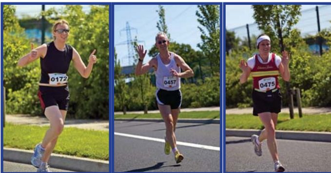
Adamstown Road Race 2010