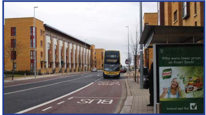
New 25b bus service within Adamstown

The new 25B bus service has replaced the 151 service in November 2010, as the primary route serving the southern area of Adamstown. The 25b service runs from the terminus at Adamstown Train Station to Merrion Square, via Adamstown Avenue, Castlegate Way, Esker Road, Griffeen Avenue, Foxborough, Ballyowen Road, Lucan Road, the N4 at Woodies, Hermitage, Liffey Valley, Palmerstown, Chapelizod bypass, Heuston Station, Merchants Quay, Aston Quay, Dawson Street, and Leeson Street. A limited number of services start at Aston Quay in Dublin City and Foxborough in Lucan. The 25b service overlaps with the 25a service on Esker Road; the route veers south to serve residential areas along Griffeen Avenue; and links back up to the 25a route at Griffeen Road for the remainder of the route.