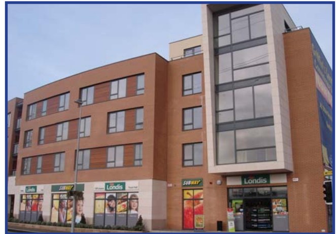
Photo of Sentinel Building containing Londis convenience store

The developers continued negotiations with potential anchor tenants for the Adamstown District Centre during 2010. The initial phase of the District Centre would include a significant Primary Health Care Centre along with a major supermarket