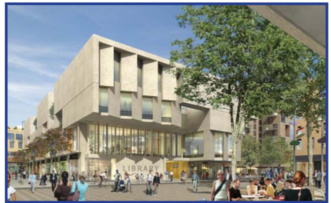
Photomontage images of Adamstown District Centre