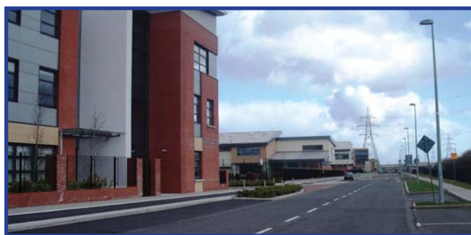
Adamstown Schools Campus - View along station road

To date there have been 1169 residential units completed and occupied within Adamstown and the infrastructure requirements for Phase 1a and Phase 1b, are now completed. The table below updates on the delivery of infrastructure required for phases 2-4.