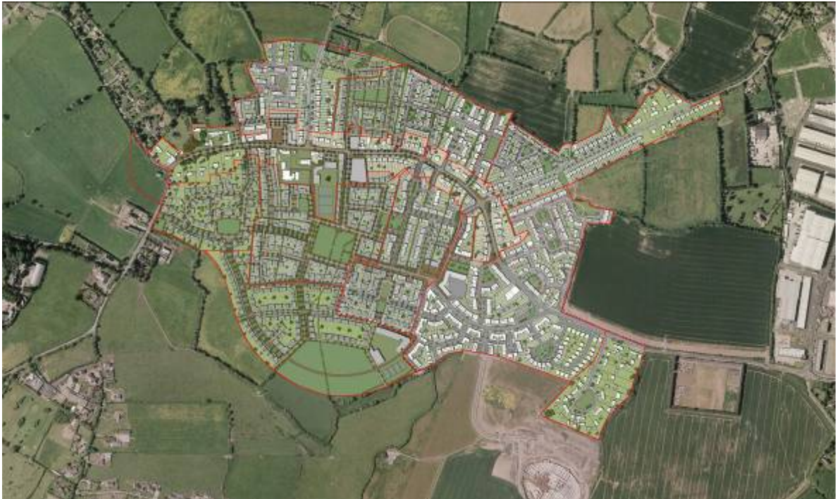
Figure 2 Overall Framework for the proposed Newcastle Local Area Plan (Artist's Impression)

The Plan is set out in a written statement with accompanying maps and tables. Figure 2 presents the overall framework for the proposed LAP while a list of the Plan's Chapters is outlined below: