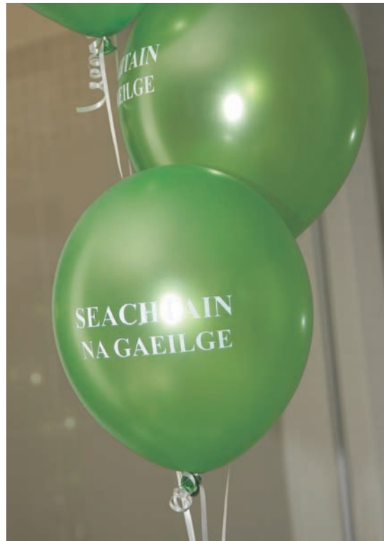
Seachtain na Gaeilge 2006.