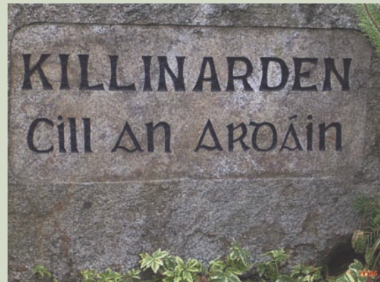
Cill an Ardáin

Tá an Rannóg Tithíochta freagrach as tithíocht an údaráis áitiúil a chur ar fáil. D'fhonn an oibleagáid seo a chomhlíonadh bíonn an Rannóg Tithíochta freagrach as aonaid chóiríochta a chur ar fáil, na haonaid atá ann cheana a chothabháil, leithdháileadh a dhéanamh ar na haonaid sin agus iad a ligean ar cíos agus cothabháil ghinearálta a dhéanamh ar na réimsí sin. Ofrálann siad líon áirithe pacáistí airgeadais chomh maith chun cuidiú leis an bpobal tithíocht phríobháideach a fháil agus tá oifig chonaire maoinne aici a dhéileálann go sonrach le tithíocht inacmhainne agus cliáint nó cliáint ionchasacha Chomhairle Contae Átha Cliath Theas.