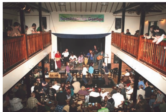
Ceolchoirm Kíla, ceann d'imeachtaí Sheachtain na Gaeilge 2006 in Áras Chrónáin, Cluain Dolcáin

Kila Concert as part of Seachtain na Gaeilge 2006 in Áras Chrónáin, Clondalkin.