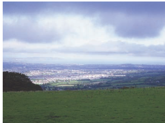
Radharc de Thamhlacht

The Housing Department is responsible for the provision of local authority housing. In order to fulfill this obligation the Housing Department is responsible for the provision of units of accommodation, the maintenance of those existing, the allocation and renting of these units, and the general upkeep of these areas. They also offer a number of financial packages to aid the public in the acquisition of private housing and have a Property Path office, which deals exclusively with affordable housing and clients or prospective clients of South Dublin County Council.