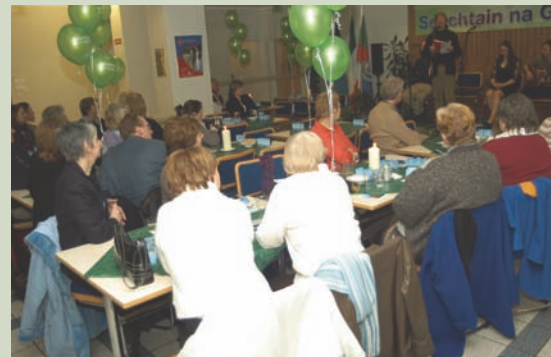
An Lucht Éisteachta ag Ceolchoirm Sheoladh Sheachtain na Gaeilge 2006.

Audience of Launch Concert of Seachtain na Gaeilge 2006