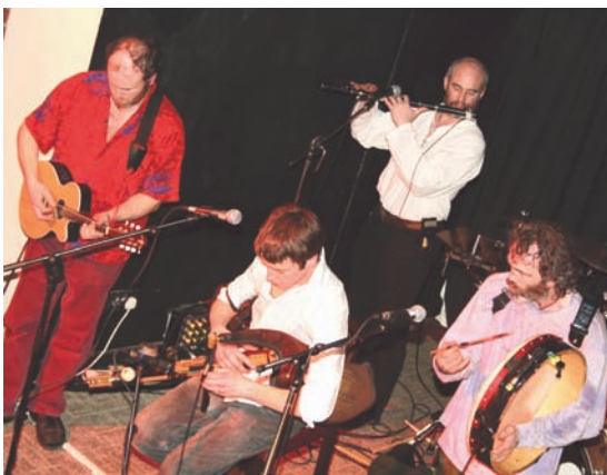
Ceolchoirm Kíla, ceann d'imeachtaí Sheachtain na Gaeilge 2006 in Áras Chrónáin, Cluain Dolcáin

Kíla Concert as part of Seachtain na Gaeilge 2006 in Áras Chrónáin, Clondalkin.