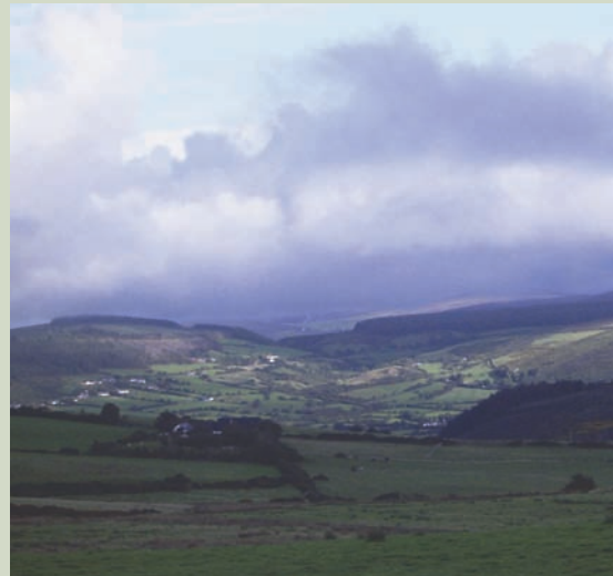
Amuigh Faoin Tuath, Contae Átha Cliath Theas