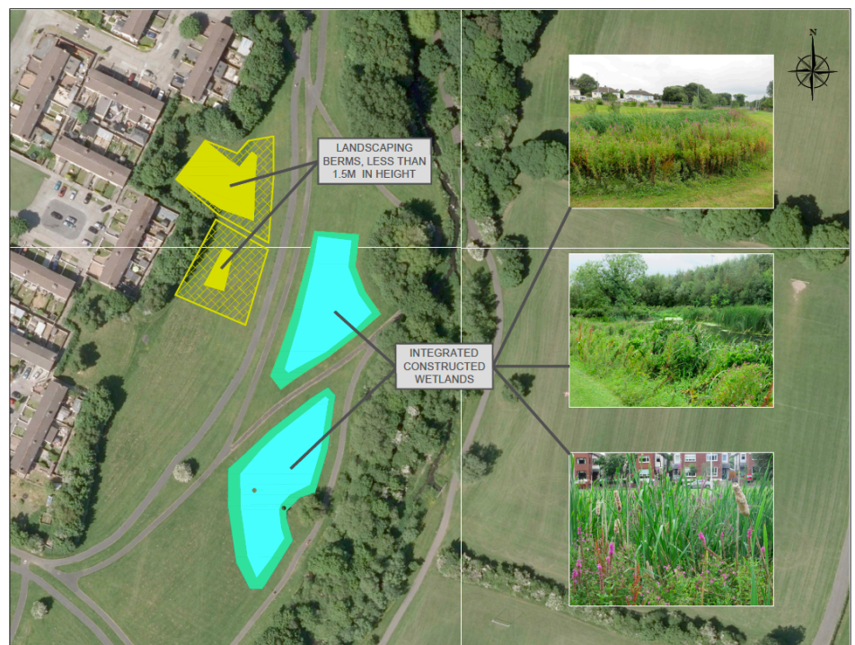
Figure 2 Proposed Site Plan

The proposed site layout is illustrated on Figure 2.