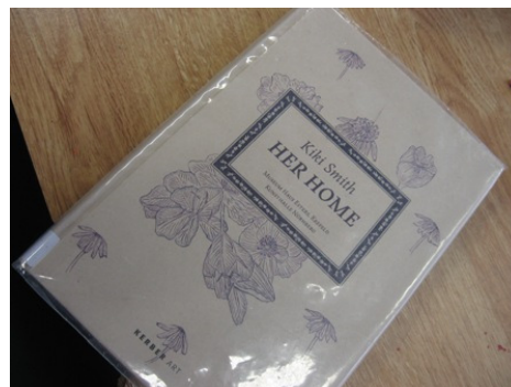
Students learned about the styles and work of modern and contemporary artists