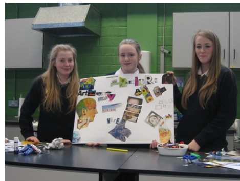
Visual historical timelines of the project and participants' experiences