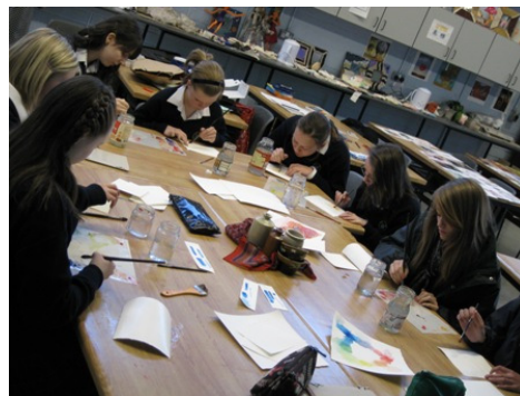
Students at work on watercolours