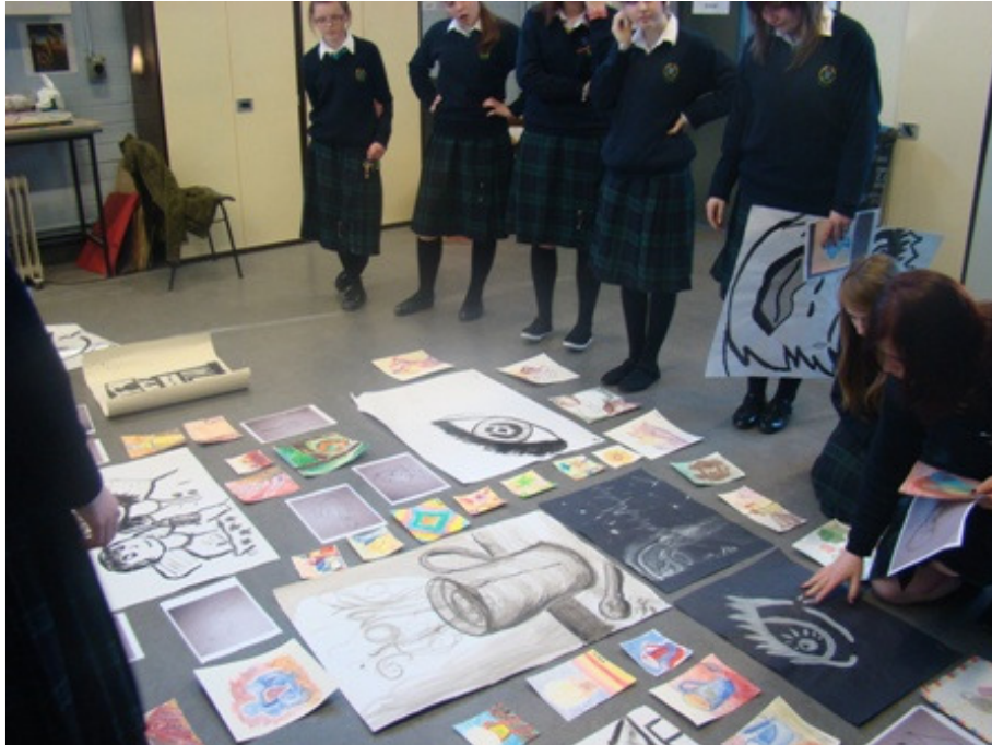
Selecting work for exhibition

Thomson, P. (2007) Whole school change: A review of the literature . London: Arts Council England. [Accessed 20 April 2010] Available at: http://www.creative-partnerships.com/data/files/whole-school-change-14.pdf