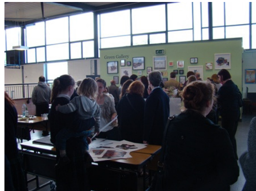
The exhibition opening of Home and the launch of the Green Gallery

The students involved in the project came from a diverse range of ages and levels within the school. This diversity may have contributed to the high level of timidity exhibited at the beginning of the project. The artist was able to 'break the ice' with and among students through 'name game' type activities and getting a radio with music into the room, creating a relaxed and fun atmosphere for focusing on creative development.