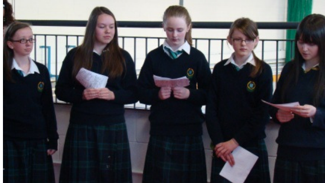
Students speaking at the exhibition opening about the Home Away from Home project.

This section details findings from the evaluation of Coláiste Bríde's Home Away from Home project and is divided into three main areas: Youth Experience, Collaborative Experience and Project Logistics. 'Youth Experience' focuses on the skills developed and experiences had by the young participants involved. 'Collaborative Experience' reflects on the working relationship of an outside artist with teachers in the school and 'Project Logistics' concerns project delivery. This chapter informs the conclusion of the evaluation report: Recommendations for Ways Forward.