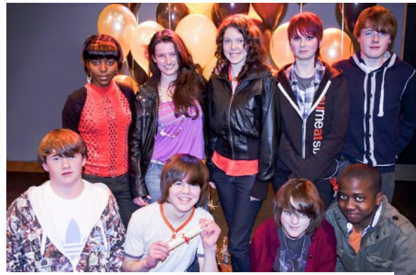
Students from Firhouse Community College, Winner of Special Mention 2011