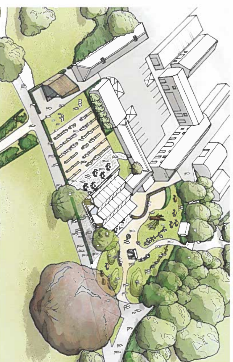
New 'hub zone' to include a Café building and a multi-use events space and stage