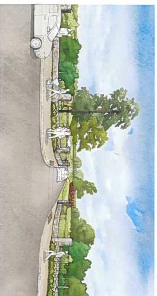
Upgrade and extension of Green Isle car park to include relocation and widening of existing entrance.