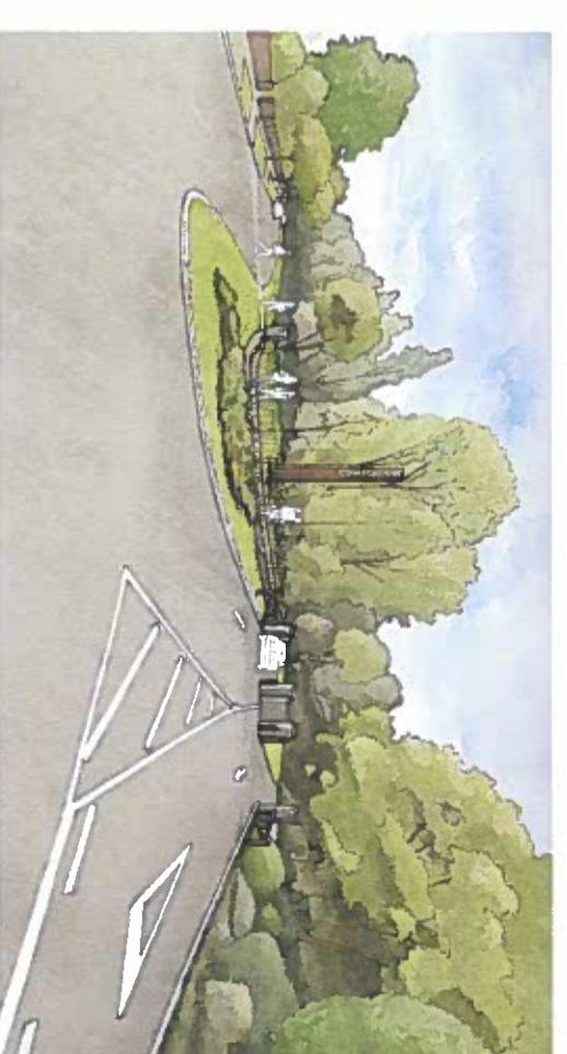
Upgrade of St. John's Wood Car Park to include resurfacing; improved pedestrian links and footpaths and entrance improvements.