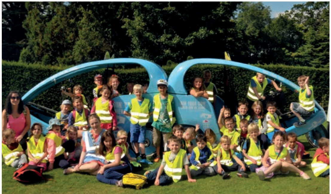
Feachtas Oideachais "Bin It" faoi Bhruscar Guma, rud a bhí eagraithe ag Comhairle Contae Átha Cliath Theas

Go hachomair, tá an sainmhíniú ar bhruscar réasúnta leathan agus ciallaíonn sé go bhfuil rud nó ábhar ar bith nach mbíonn diúscairthe i gceart, nó a d'fhéadfadh a bheith gránna, go bhfuil sé sin mar bhruscar. Ar na nithe atá i gceist leis seo, tá cupán caife nó bun toitín a chaitear ar an tsráid nó a chaitear ó fhuinneog cairr, graifítí, diúscairt dramhaíl tí i ngabhdáin phoiblí bruscair, comharthaí gan chead, salú ag madraí, dumpáil méid mór bruscair nó dramhaíola.