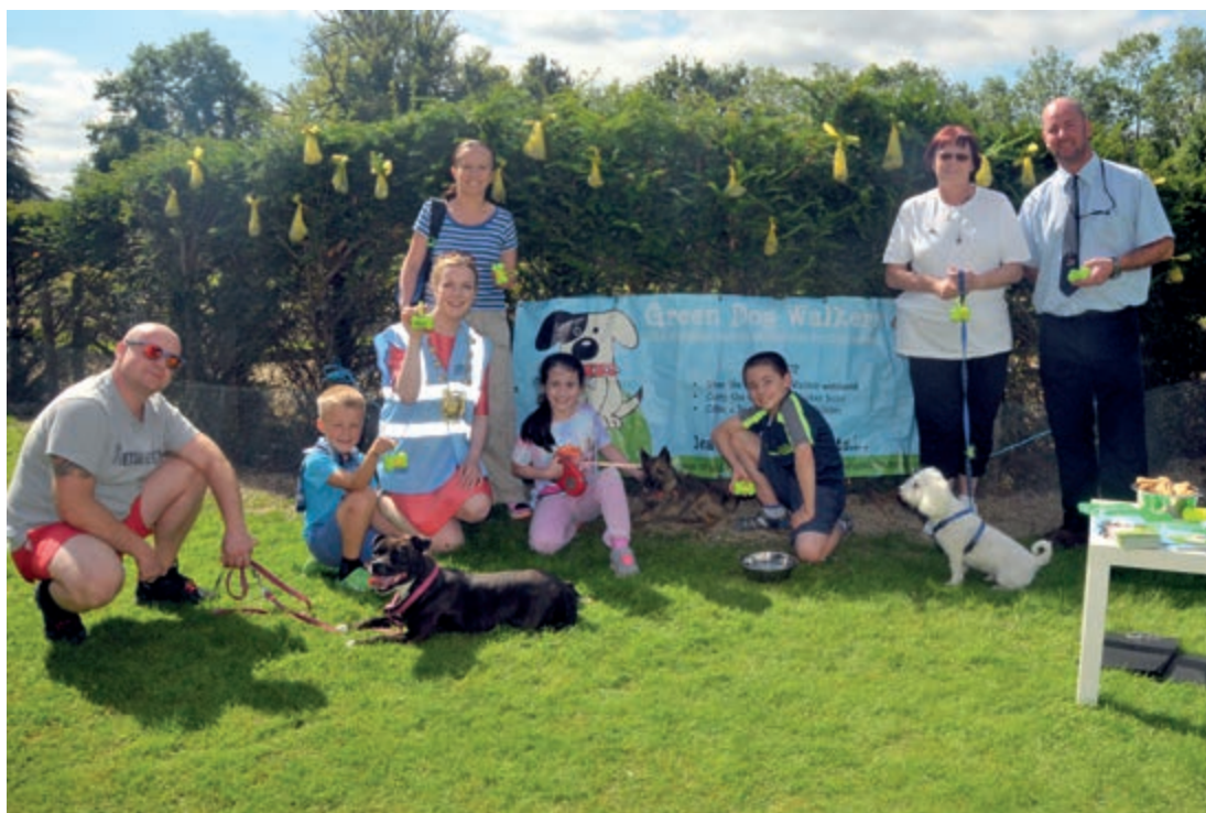
Tionscnamh Siúlóirí Glasa Madraí de chuid Chomhairle Contae Átha Cliath Theas