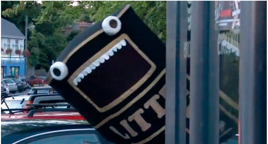
South Dublin County Council Tackle Litter video – www.sdcc.ie