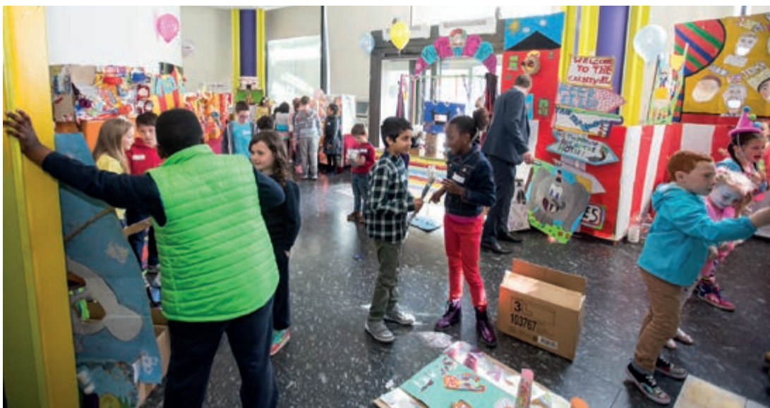
Feachtas Frithbhruscair Chomhairle Contae Átha Cliath Theas

Tabharfaidh cuspóirí an phlean aird ar ráiteas misin agus cuspóirí an Phlean Chorporádaigh, 2015 – 2019, chun go mbeidh Contae Átha Cliath Theas ar an áit is fearr mar áit chónaithe, oibre agus ghnó. Tabharfaidh sé aird chomh maith ar phleanáil agus forbairt chuí an chontae agus ar fhorálacha an Phlean Forbartha Contae.