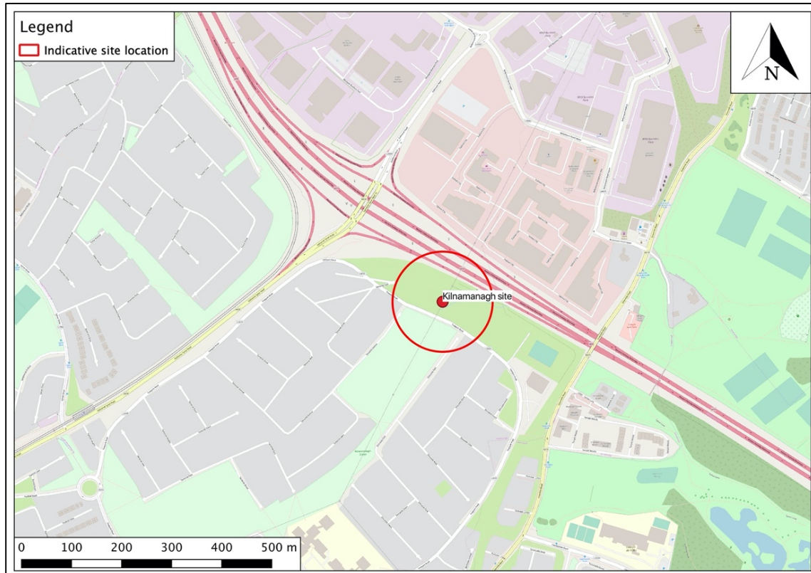
Figure 1: Location of proposed ICW development site (Red line is indicative, refer to accompanying documentation for full details)

The proposed development site location is shown in Figure 1 .